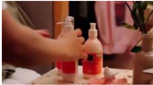
Figure 2. Product Placement Scarlett Whitening in Drama Today's Webtoon