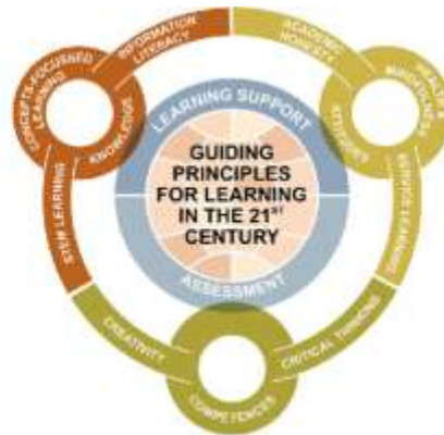
Figure 2. Essential Skill 21 st century (Hughes and Acedo (2014))