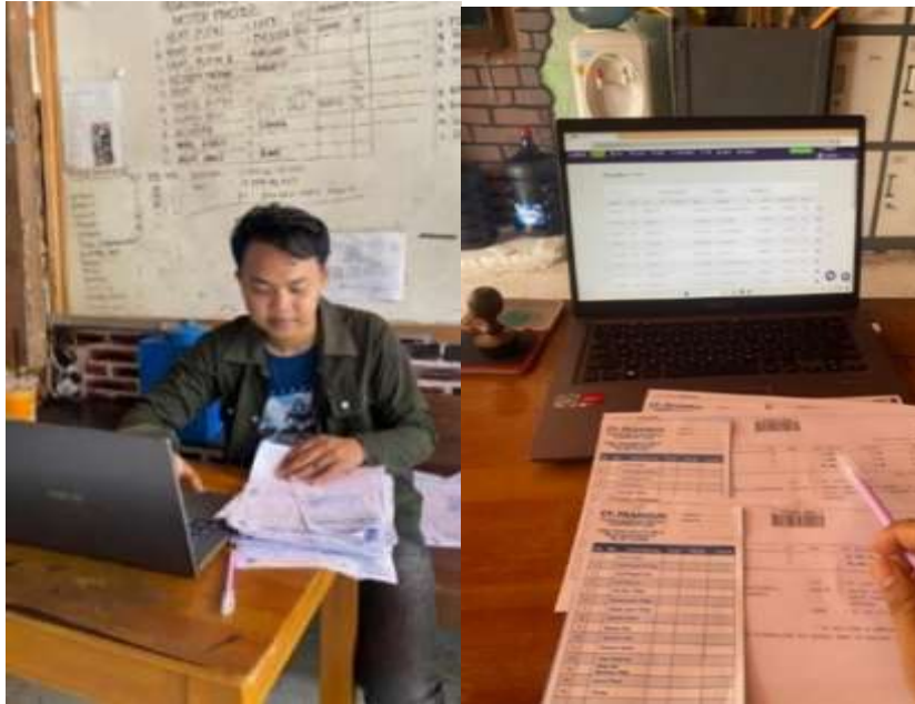
Figure 8. Customer Database Input