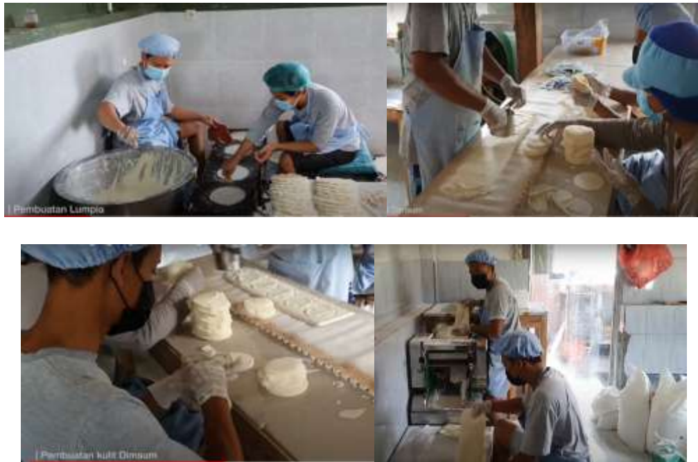
Figure 2. Production Process at Jempol Food

Jempol Food produces a variety of basic ingredients for snack/food products such as spring roll skin, dumpling skin, dimsum skin, rolade and others. The prices offered are very affordable starting from Rp. 10,000 to Rp. 15,000,-. Jempol Food's marketing area covers all regions in Indonesia, especially in Yogyakarta, Central Java, West Java, and Jakarta. Product marketing is carried out by opening outlets in a number of mini markets and shopping centers both in Yogyakarta and in other cities. In addition, Jempol Food also provides opportunities for other parties to become resellers. Product promotion is carried out through intensive promotion in mini markets and shopping centers by displaying Jempol Food products on display shelves and freezers. In addition, promotions are also carried out online through the website: www.Jempolfood.com , social media and marketplaces: Instagram, Facebook, TikTok and Shopee. In distributing products, online platforms such as Shopee Food, Grab Food and Go Food are also used.