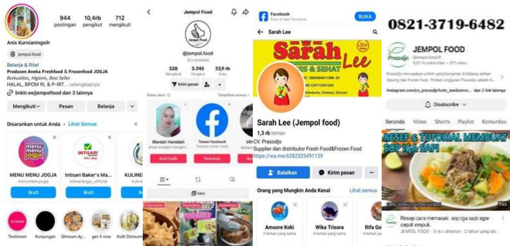
Figure 4. Jempol Food Online Promotion Media

The development of Jempol Food's business continues to increase along with the many product demands. However, there are still a number of shortcomings in its business operations. Based on the results of interviews with Jempol Food management, it can be explained that a number of problems faced in developing a business, especially in the field of marketing, are: (1). Lack of online marketing activities due to limited human resource skills and conventional promotion programs are not optimized, (2). There is no customer loyalty program that can attract consumers to remain loyal to buy products at Jempol Food, and (3). There is no database of resellers and individual consumers. To overcome these problems, the solutions to the work programs carried out in this activity are: (1). Providing education for the development of promotional content through online marketing media and intensifying conventional promotional programs by approaching potential consumers directly, (2). Making customer loyalty cards that can be used by resellers and consumers to get incentives or rewards from Jempol Food, and (3). Compile a database of resellers and consumers.