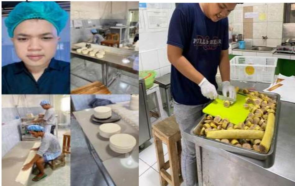
Figure 9. Assisting Production Process Activities

An additional work program carried out at Jempol Food is to help in the production process so that they can understand the stages in the production process. The production process is carried out manually and combined with modern technology. In the production process, hygiene, cleanliness and cleanliness factors are the main focus so that the products produced are guaranteed quality. The following are the activities carried out to help the production process: