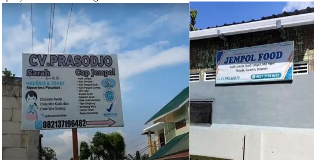
Figure 1. Thimb Food Business Location

One of the MSMEs that is developing in Yogyakarta is Jempol Food, which is mainly engaged in the production of snack and processed food raw materials. Jempol Food is a trademark of CV Prasodjo which has been operating since 2013. This MSME is located in Sembuh Wetan, RT.04/RW. 25, Sidokarto, Godean, Sleman, Yogyakarta. The main purpose of this business is to help improve the economy, especially the surrounding community through the absorption of labor. The vision of Jempol Food is to care for the environment and produce clean and quality products. In running its business, Jempol Food is supported by 20 employees with working hours from 08.00 to 17.00 WIB.