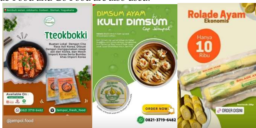
Figure 3. Jempol Food Product Samples

Jempol Food produces a variety of basic ingredients for snack/food products such as spring roll skin, dumpling skin, dimsum skin, rolade and others. The prices offered are very affordable starting from Rp. 10,000 to Rp. 15,000,-. Jempol Food's marketing area covers all regions in Indonesia, especially in Yogyakarta, Central Java, West Java, and Jakarta. Product marketing is carried out by opening outlets in a number of mini markets and shopping centers both in Yogyakarta and in other cities. In addition, Jempol Food also provides opportunities for other parties to become resellers. Product promotion is carried out through intensive promotion in mini markets and shopping centers by displaying Jempol Food products on display shelves and freezers. In addition, promotions are also carried out online through the website: www.Jempolfood.com , social media and marketplaces: Instagram, Facebook, TikTok and Shopee. In distributing products, online platforms such as Shopee Food, Grab Food and Go Food are also used.