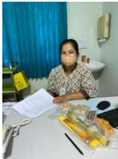
Figure 6. Offline Promotion through Personal Selling