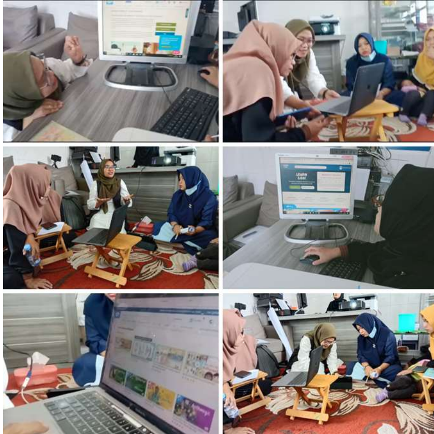
Figure 5. The Researchers as Facilitators to Operate the Twinkl Usage

Focusing on dynamic and interactive methodologies for young learners, the teachers were introduced to how to browse and select the appropriate resources. The teachers practiced how to operate the school's computer and search how to find lesson plans. Moreover, the teachers also explored innovative strategies that aligned with Twinkl's resources, which then ensured that the lesson plans they chose were suitable and matched with the ongoing lesson plans used by the school. They also ensured that the lesson plans were not only educational but also captivating for preschool and kindergarten students' needs in this school.