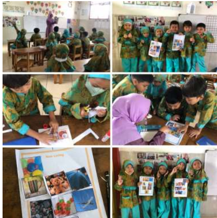
Figure 7. Learning Session 2 for TK B2 Students

By the end of the learning sessions, students proudly presented their finished worksheets on the classroom board. They also presented their projects in front of the class by naming the objects in English vocabulary guided by the teachers. This method not only made the learning enjoyable but also effectively reinforced the kindergarten students' learning of English skills, particularly in naming some words or vocabulary.