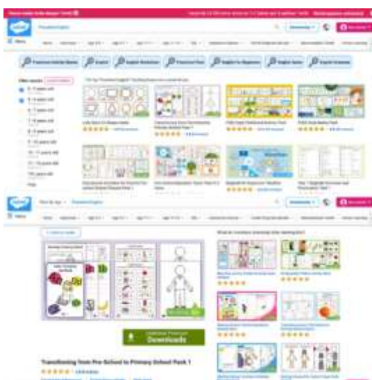
Figure 1. The Twinkl Educational Publishing's Website

Twinkl Educational Publishing is one of the leading digital education publishers that offers a wide range of educational resources and tools for teachers and parents. Basically, these all resources are designed to support learning across various subjects like Science, Arts, Social, etc, ranging from the age group of early years learners to Year 10 students. Moreover, according to the Twinkl website at https://www.twinkl.co.id , there is a notable study conducted by Twinkl which focused on the "Twinkl Little Red Coding Club" app, aimed to investigate young learners aged 4-6 years old engagement and learning with Augmented Reality (AR) application. From this study, Twinkl highlights that this platform's commitment to innovative and interactive educational tools cater to the needs of young learners.