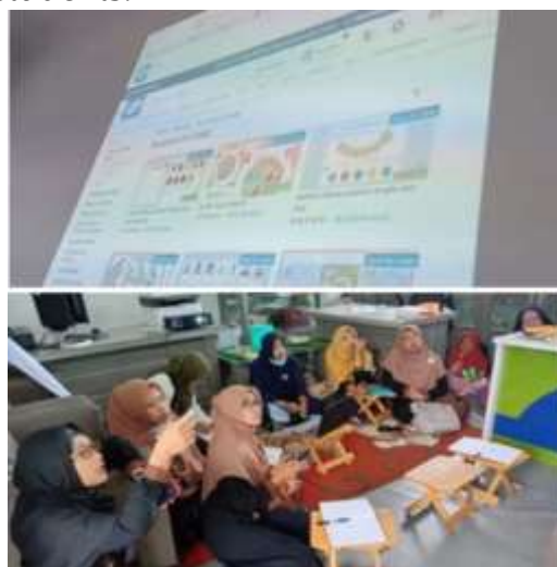
Figure 4. The Teachers' Interactions and Discussions During the Twinkl Workshop Session

During Twinkl's workshop sessions, teachers had a thorough introduction to the platform and gained an understanding of its features, functions, and potential integration into their daily teaching plans. This workshop session aimed to familiarize the teachers with the wide range of resources available on Twinkl, emphasizing its adaptability to their curriculum which could be different from the national curriculum. The teachers also might adapt various teaching approaches not only for English learning materials but more specifically for all topics taught for the students.