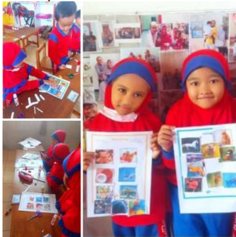
Figure 6. Learning Session 1 for TK B1 Students

The two existing kindergarten classes at KB & TK Al-Madani were selected to deliver the learning session in two weeks respectively. Started with the TK B1 class this week and then followed by the TK B2 class the following week. These two classes implemented the same techniques that had been developed during the workshop session. The teachers first downloaded the worksheet from Twinkl's platform then printed it and handed it out to the students in the classes.