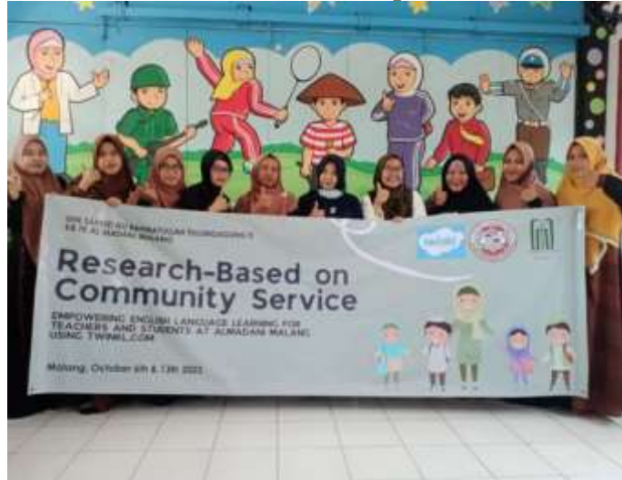
Figure 3. The teachers' Participation in the Twinkl Training

In the following step, the researchers provided specialized training sessions for teachers with a focus on the efficient utilization of Twinkl's platform as a leading educational publisher for the early years of learning particularly for English language teaching. The researchers organized the workshop that was designed for teachers' teaching skills, emphasizing the interactive teaching methods that integrated with technology and personalized learning techniques with were suitable for the school's self-developed curriculum.