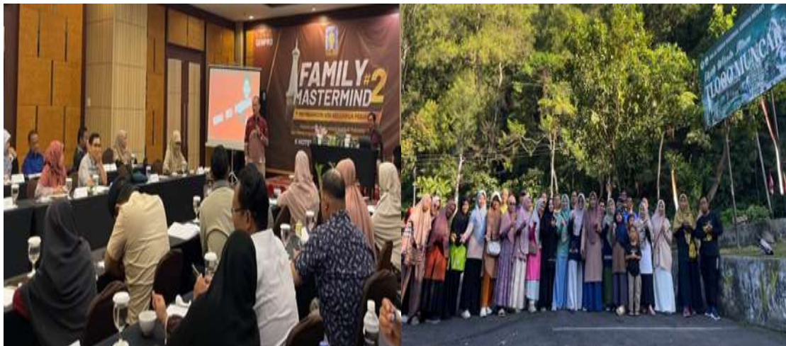
Figure 3. Kultum after Subuh Prayer and Tadzabur Alam

The training on the second day, Sunday, August 25, 2024, began with congregational Tahajud prayers, morning dhikr, congregational Subuh prayers and a religious sermon. The service team then invited participants to take a healthy walk while adzaburing the beautiful nature in the Tlogo Putri - Kaliurang area.