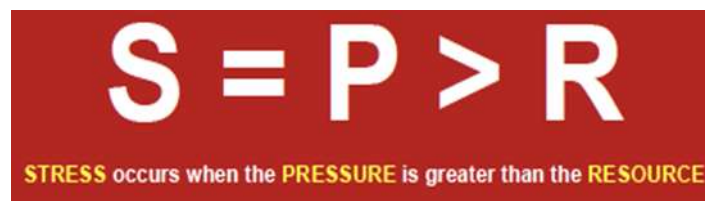
Figure 2. Stress Formula

It is better for a person to master stress in life than to be crushed by stress. Stress is a person's reaction to excessive pressure or demands placed on him. Stress occurs when a person begins to worry that they cannot cope with the pressure.