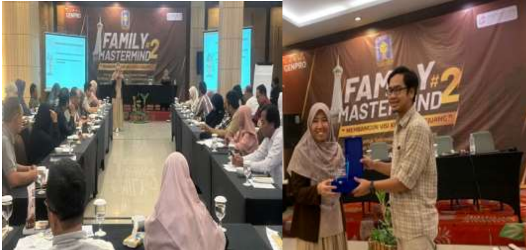
Figure 2. Documentation of Training Day I

The training on the second day, Sunday, August 25, 2024, began with congregational Tahajud prayers, morning dhikr, congregational Subuh prayers and a religious sermon. The service team then invited participants to take a healthy walk while adzaburing the beautiful nature in the Tlogo Putri - Kaliurang area.