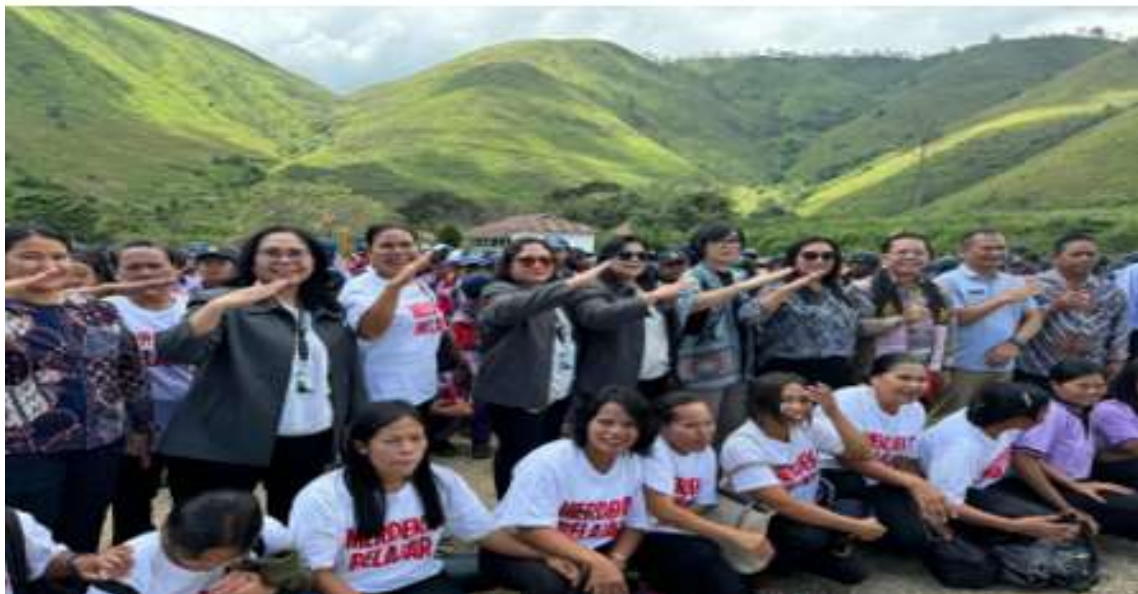
Figure 10. The Enthusiasm of Speakers and Teachers

Abraham Maslow's theory focuses on basic human needs. Maslow's hierarchy of needs consists of five levels, and to achieve optimal motivation, a person needs to fulfill needs at lower levels first (Bari, A., & Hidayat, R., 2022; Hale, et al., 2019). Physiological needs: Middle school children must feel safe and comfortable, both physically (food, shelter) and psychologically. Safety needs: Children must feel safe both at home and at school. Social needs: Children need to feel accepted by their peers, teachers and family. Esteem needs: Children feel appreciated and recognized for their achievements, which provides encouragement to continue learning. Self-actualization needs: At this level, junior high school children can begin to develop their potential to achieve their dreams, such as becoming a doctor, engineer, teacher, artist, accompanied by effort from an early age.