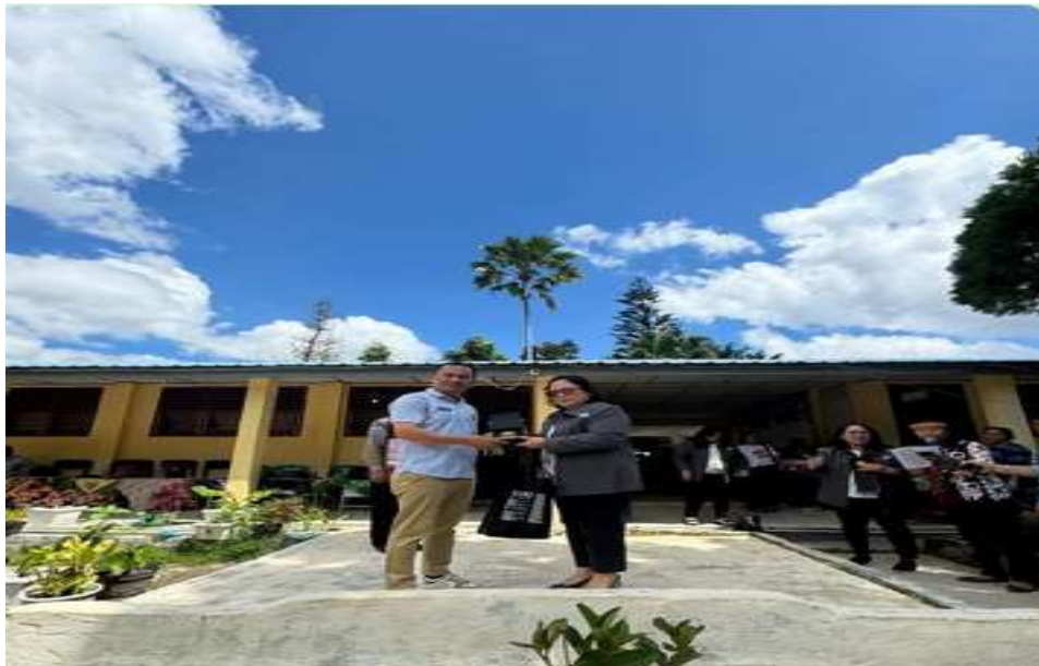
Figure 4. Giving Souvenirs from UKI to the Head of the Samosir Regency Education Office