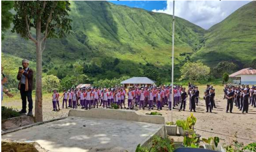
Figure 7. Students of SMP Negeri 2 Harian District are Listening to Counseling

Resource persons prepare books, materials in the form of soft files and learning videos. The resource person simulates how to carry out learning.