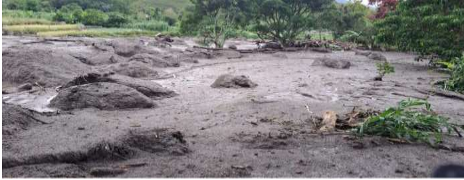
Figure 1. Rocks and Mud Carried By Flash Floods

Figure 1 shows rocks and mud carried by flash floods destroying rice fields and community fields. The rice had started to turn yellow, corn and other crops had been washed away by the flood. Source of community income from agriculture. As a result of flash floods, people experienced economic difficulties.