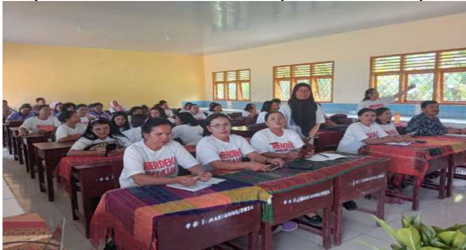
Figure 11. Teachers Happily Participate in Training

The training to increase teacher competency was welcomed with joy by all participants because of the teachers' recognition that so far they had taken part in training organized by the government which so far had only been implemented by limited teachers. Apart from that, the participants were happy because they felt the attention of the community which was a family relationship.