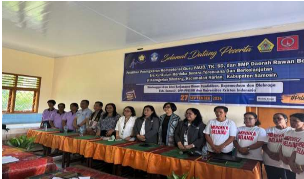
Figure.6 Singing the Song Indonesia Raya and Mars Samosir Regency

Activity evaluation is carried out after completing the activity where participants are asked to provide testimony. Participants said they were very happy to take part in the training. Even though there were traditional activities on the same day, participants chose to continue participating in the activities until they were finished. The chairman of the school committee was also fully present to provide supervision of activities.