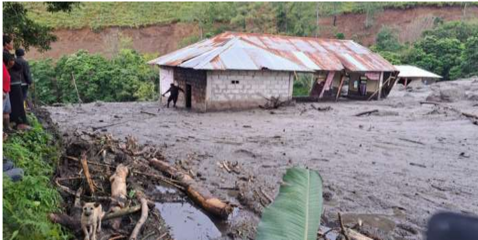
Figure 2. Refugee Place

Figure 1 shows rocks and mud carried by flash floods destroying rice fields and community fields. The rice had started to turn yellow, corn and other crops had been washed away by the flood. Source of community income from agriculture. As a result of flash floods, people experienced economic difficulties.