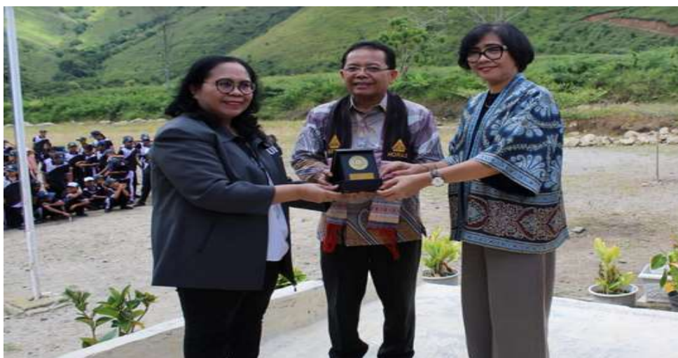
Figure 5. Giving Souvenirs from UKI to Head of Sihotang Organization