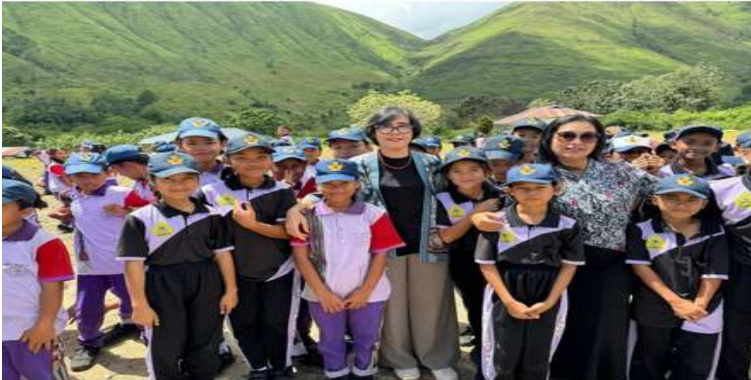
Figure 9. Smiles of Outstanding Students