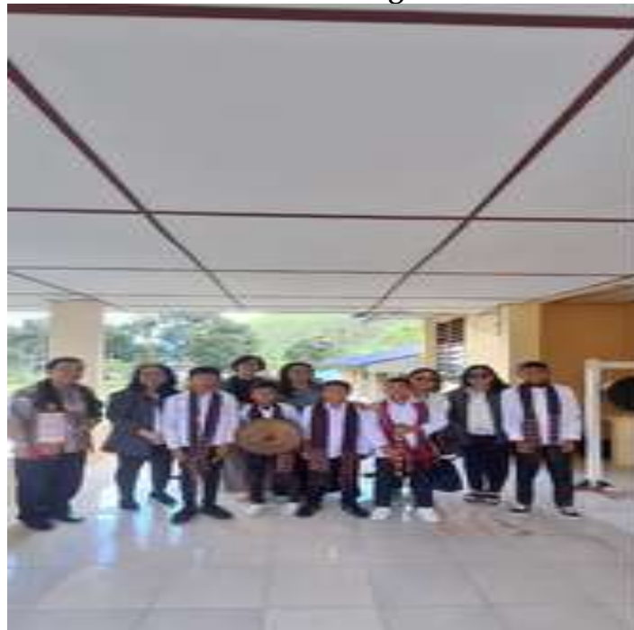
Figure 8. Student of SMP Negeri 2, 1st Champion in the Provincial Level Art Competition