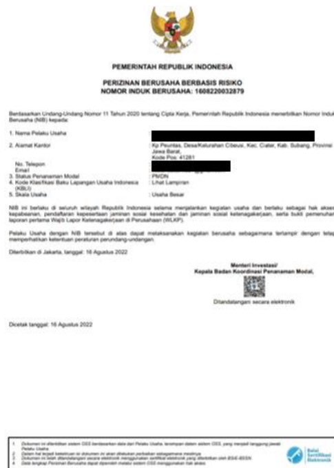
Figure 6. NIB Certificate That Has Been Submitted

The result of this service activity is that the author gives a certificate of NIB registration results. This activity is carried out by giving certificates directly to MSME business actors in Cibeusi Village.