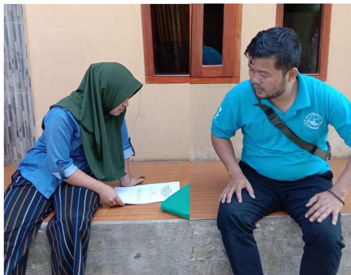
Figure 2. Invitation

At this stage, the author collects data on MSMEs in the Cibeusi Village environment as well as provides audience invitations. The hearing process will be carried out in the Village Hall to get information related to the complaints of business actors.