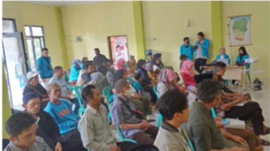
Figure 3. MSME Business Actors In The Audience

From the results of the hearings that have been carried out, the majority of MSMEs in Cibeusi Village do not yet have an NIB. The data can be seen in Figure 4 below: