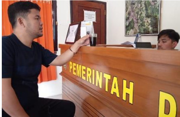
Figure 5. The Process of Making a Business Registration Number

After the business actors have collected the requirements for the establishment of NIB, the NIB application is carried out utilizing NIB through www.oss.go.id . If the registration is successful, the system will send an email containing a code that will be verified by business actors. Business actors have successfully obtained access rights for NIB registration.