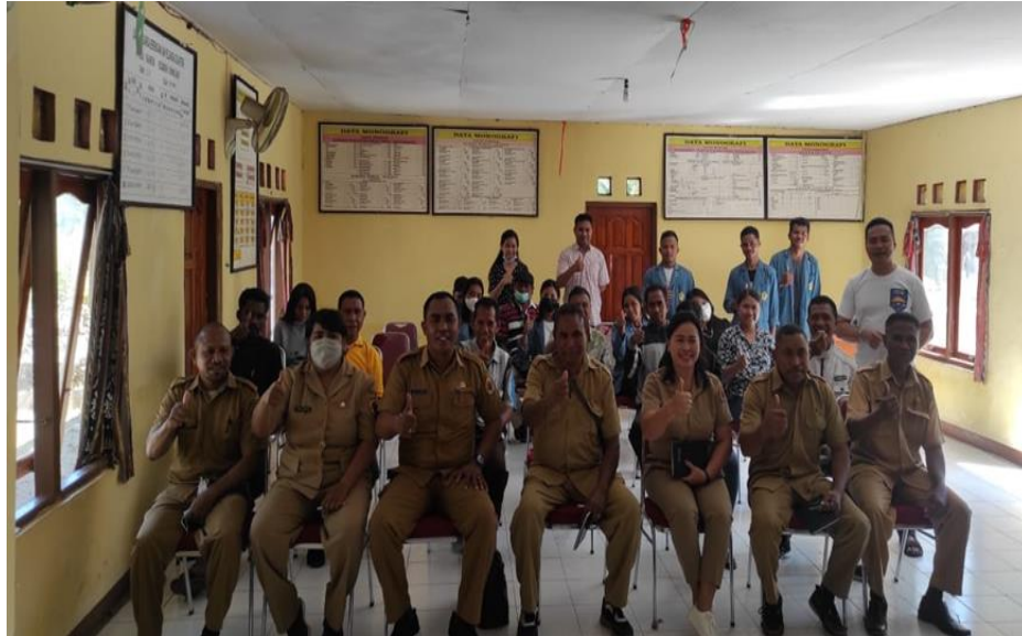
Picture 4. BUMDes Strengthening Socialization Participants

economic sector of the village. In this training session, BUMDes management gained a great deal of new information; the head of BUMDes gave this statement. The aim is to communicate what has been presented and discussed to the community.