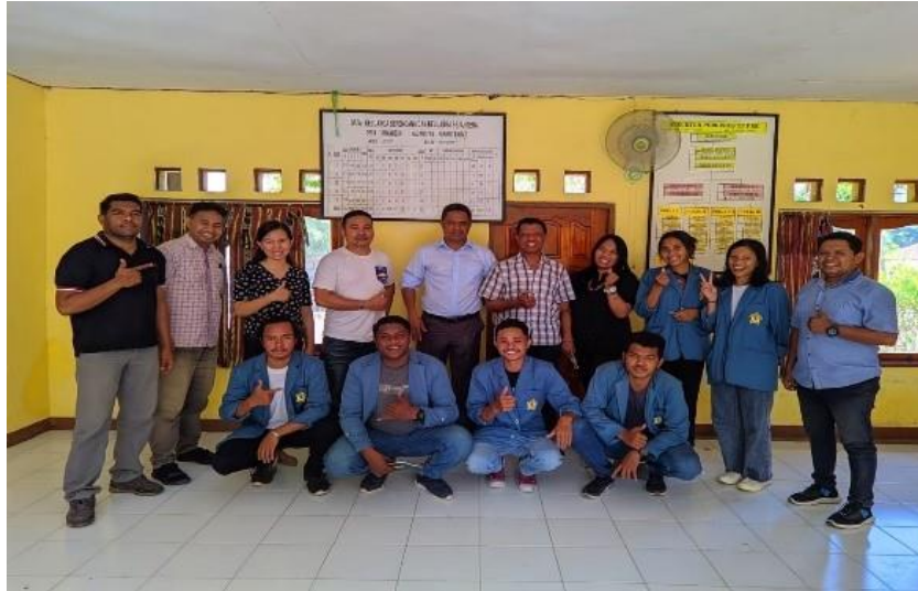
Picture 2. The Head of LPPM UNWIRA and staff, Field Supervisor, and UNWIRA students during the socialization

The socialization activities were carried out at the Kuanheum village hall office in collaboration with the Institute of Research and Community Services (LPPM) of Widya Mandira Catholic University. It was done in two days, with the main agenda being presentations of the regulations and opportunities, sharing and discussions regarding the obstacles faced by the employees, and potential resources of the village. The Kuanheum residents attended the activity, district and village officials, BUMDes administrators, hamlet heads, field supervisor, and students as part of the KKNT-PPM Team.