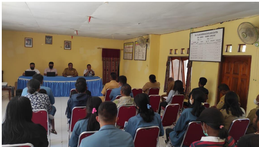
Picture 3. All the participants attentively follow the presentations

The socialization activities were carried out at the Kuanheum village hall office in collaboration with the Institute of Research and Community Services (LPPM) of Widya Mandira Catholic University. It was done in two days, with the main agenda being presentations of the regulations and opportunities, sharing and discussions regarding the obstacles faced by the employees, and potential resources of the village. The Kuanheum residents attended the activity, district and village officials, BUMDes administrators, hamlet heads, field supervisor, and students as part of the KKNT-PPM Team.