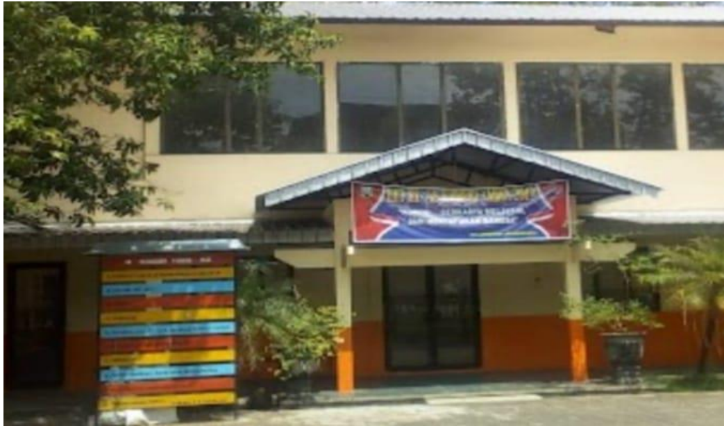
Figure 1. Langensari Village

Community Service (PkM) was held in August 2021 at Langensari Village, West Ungaran District, Semarang Regency, the journey to the location was 3.6 KM. with a total of 20 participants were PKK mothers in the Langensari Village. Community service activities involve 2 students from the Fashion Design Vocational Education study program to assist community service activities. The place used for the training was the Langensari village hall along with the service location.