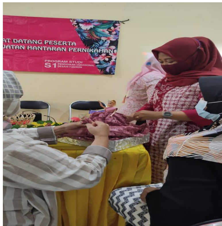
Figure 4. Practice of Making Peningset

Based on the results of questions and answers with the participants, information was obtained that participants in delivery training activities which were dominated by PKK women stated that they had never participated in training activities regarding delivery, so this service activity was new for the mothers of Langensari Village residents. Based on the results of the participant