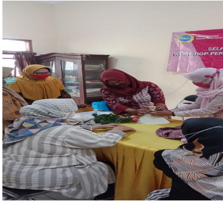
Figure 3. Practice of Making Peningset