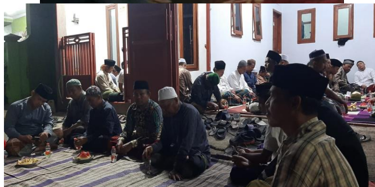
Figure. 4 Discussion with RT.03 Residents of Bumi Ayu Village, Malang City