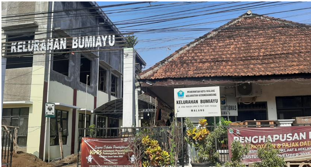
Figure.2 Bumi Ayu Village Office, Malang City

This activity aims to build joint commitment between Bumiayu community members and community leaders, religious leaders, administrators RT 03 dan pengurus RW 04 tentang pemekaran RT to accelerate community welfare, especially in RW 04 Bumiayu Village Malang City. Third, assistance in the expansion of RT 03 Bumiayu Village, Malang City. Through this activity, it is hoped that the expansion in RT 03 will become one or more new RTs.