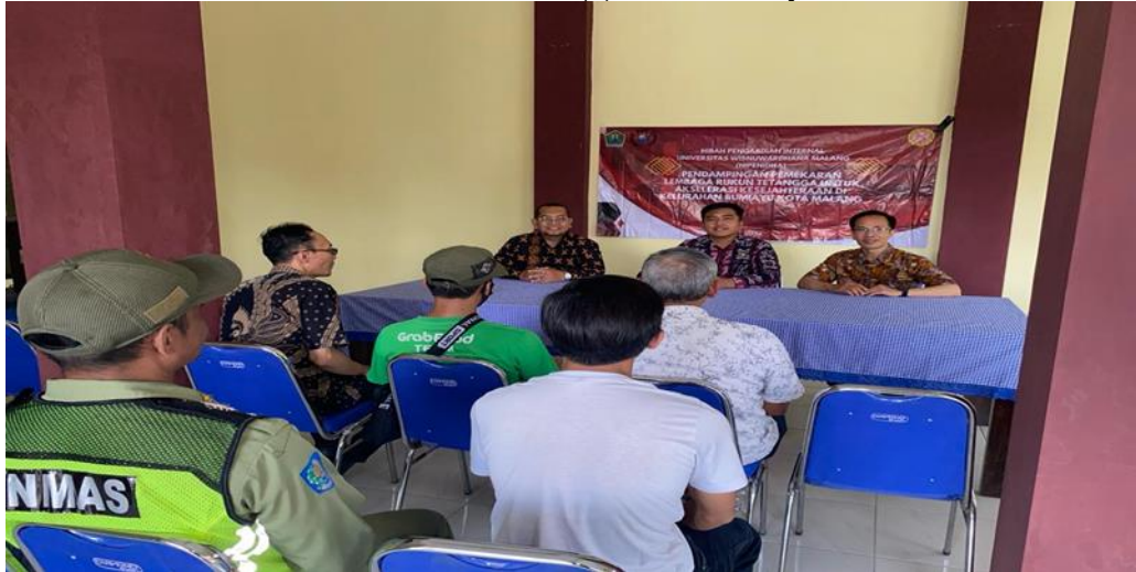
Figure.3 Discussion with the elected RT Chairman and Bumi Ayu Village Head.