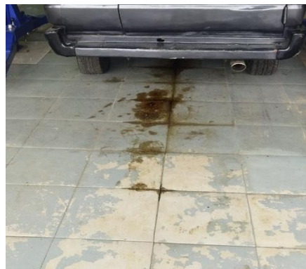
Picture 3 unclean work area

An unorganized workplace is a workspace that lacks structure, order, and efficiency in its layout and processes. This can result in a cluttered and chaotic environment that can have a negative impact on productivity, safety, and overall efficiency