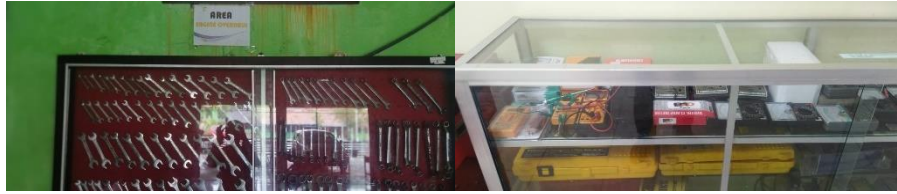
Picture 6 Tools set in order

The necessary tools are already arranged in a logical and efficient manner. tools have provided specific locations for tools, equipment, and materials, and established a labeling system.