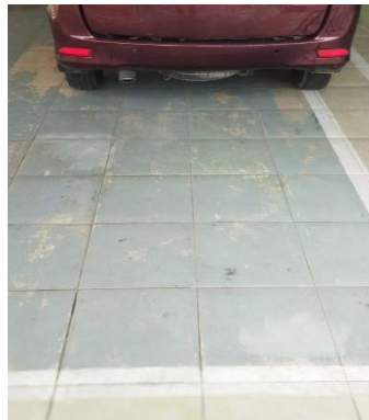
Picture 7 clean workplace

The necessary tools are already arranged in a logical and efficient manner. tools have provided specific locations for tools, equipment, and materials, and established a labeling system.