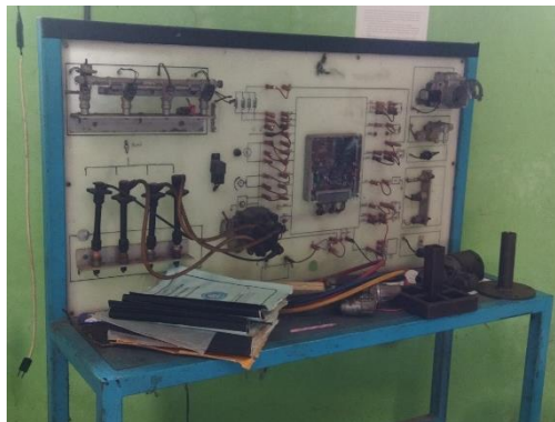
Picture 1. Clutter in the workplace

Clutter in the workplace refers to accumulation of unnecessary or disorganized items, materials, and equipment that can interfere with productivity and create an unsafe or unpleasant working environment. here is an example, such as paper piles, unorganized tools, and personal items.