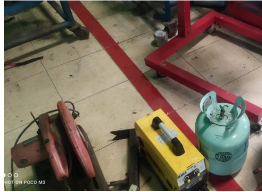
Picture 2 unorganized workplace

An unorganized workplace is a workspace that lacks structure, order, and efficiency in its layout and processes. This can result in a cluttered and chaotic environment that can have a negative impact on productivity, safety, and overall efficiency