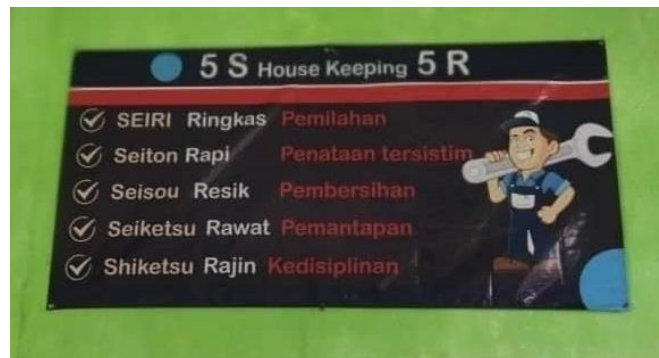
Picture 8 Correct 5S Poster

Work area has been thoroughly cleaned, including floors, walls, and equipment. But it is still necessary to develop a cleaning schedule and establish procedures for maintaining cleanliness.