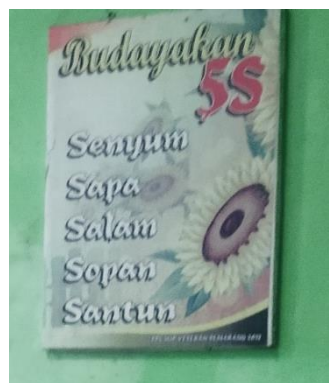
Picture 4 wrong 5S Poster

An unclean work area is a workspace that is dirty, unsanitary, and has not been properly cleaned. This can create a variety of problems, such as health and safety hazards these conditions can create a slip and trip hazard due to spilled oil that has not been cleaned up