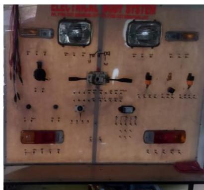
Picture 5 sorted out workplace

Following are the results of the monitoring of the progress carried out: