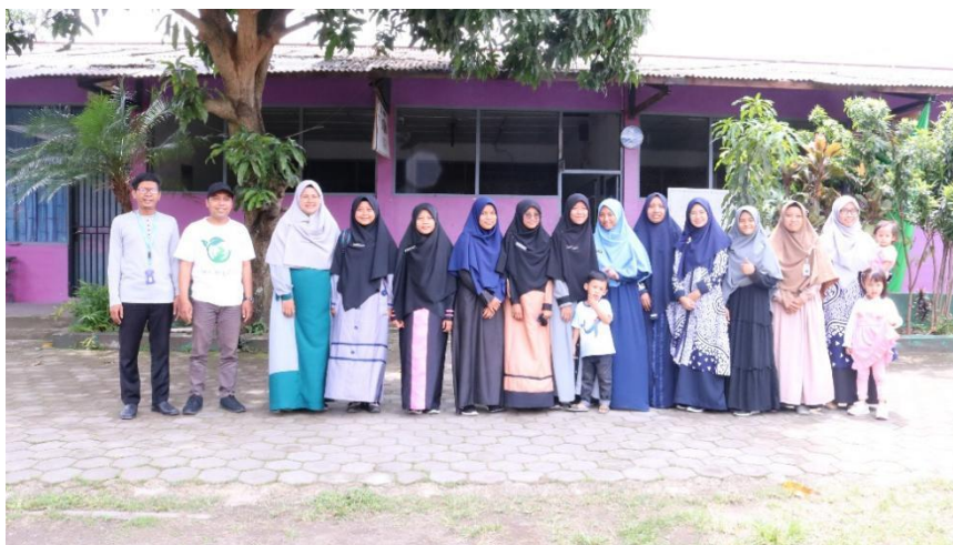
Figure.5 The Service Team, together with the Foundation Management and Participants

In order to equip Generation Z with essential skills for a prosperous future, a service program focusing on Sharia financial planning socialization was conducted for students of SMKIT Smart Informatika Solo Peduli, located in Surakarta, Central Java. The program took place on Saturday, November 26, 2022. The community service activities commenced with an initial initiation, followed by coordination with the program leader, observation, socialization, and the implementation of various components such as pre-test, traditional delivery of material, question and answer session, post-test, as well as evaluation and reporting.