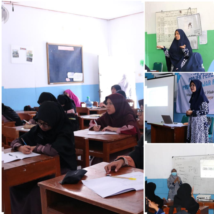
Figure.3 Implementation of Pre-Test and Presentation of Material

Students at SMKIT Smart Informatika acquired a wealth of new knowledge regarding Sharia financial planning. In addition to asking questions about the material, they also showed interest in discussing their future study plans for university. Based on the completed questionnaires, it was evident that students found the provided material highly beneficial, and some even expressed a keen desire to learn more about financial planning and investment strategies.