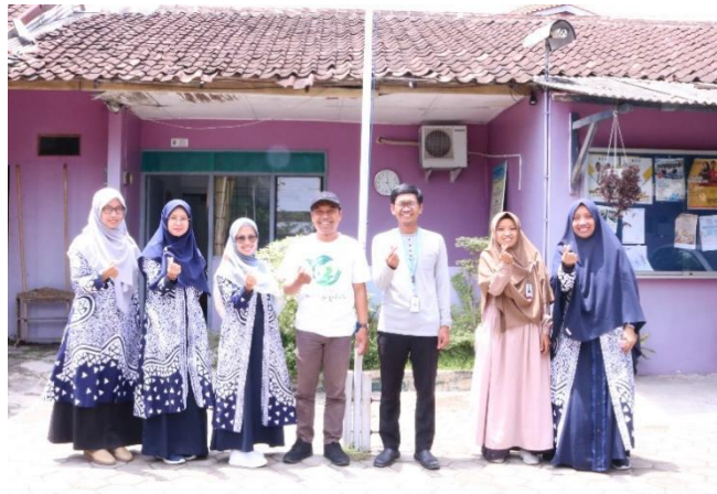
Figure.2 The Service Team, together with the Foundation Management

Furthermore, initial coordination with the management of the Solo Peduli Ummat Foundation took place on October 26, 2022. During this coordination, it was discovered that despite receiving free educational facilities from the foundation, the students still received pocket money from their families. The Chairman of Solo Peduli Ummat Foundation emphasized the importance of equipping students with financial management and planning knowledge, as these skills are crucial for their future endeavors, including pursuing higher education, entering the workforce, or venturing into entrepreneurship. Based on the information gathered during the initial coordination, the team prepared the necessary materials and schedule for the community service program. The implementation details were then shared with students through their teachers, who allocated dedicated time in accordance with the proposed schedule. The community service activity took place on November 26, 2022, and teachers and students of SMKIT Smart Informatika warmly received the team from Yogyakarta.