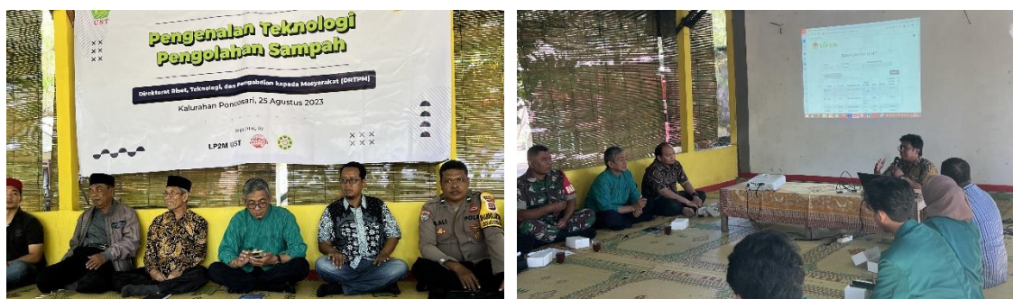
a) Attended by several officials of Poncosari Urban Village

This activity was held at one of the representative food stalls in the Baru Beach Tourism Area on Friday, 25 August 2023. The Head of Poncosari Urban Village officially opened the event to show strong support for this activity. Meanwhile, the activity presenter is an academic with expertise in waste management and practical experience in applying waste processing technologies. The speaker gave a lecture introducing several technologies, such as pyrolysis, gasification, and biogas, to give participants a more comprehensive insight into the various options available for processing organic waste. Atmosphere activity's devotion to the public can be seen in Figure 2.