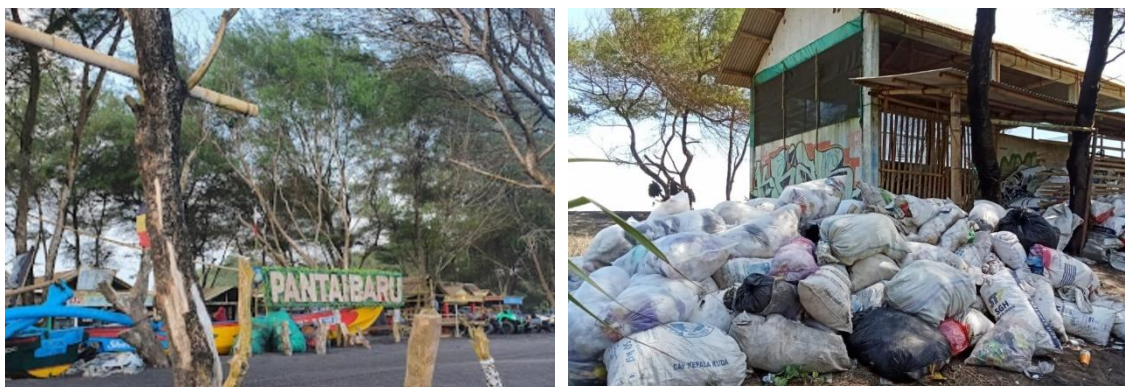
a) Baru Beach tourist area

One critical aspect that requires serious attention is managing organic waste in the Baru Beach Tourism Area, which is one of the operational focuses of BUMKAL Mukti Lestari (Figure 1). Efforts to date have not been entirely successful in overcoming the problem of organic waste in the area (Sudjono, 2023). To overcome the problem of organic waste in the Baru Beach Tourism Area, it is important to increase active community participation (Kalra, 2020). One way to achieve this is through community service activities related to waste management. Community service activities in Indonesia are integral to sustainable development, especially in rural community development, waste processing, and sanitation (Mangindaan, 2021).