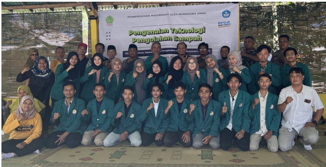
Figure 3. Group photo after the activity between participants and the community service team

In community service activities using the lecture method, participants are introduced to waste processing technologies, including pyrolysis, gasification, and biogas. Next, the material focuses on pyrolysis technology, which can convert organic waste into charcoal. 20 UST students prepared this activity. Students are accompanied by 2 lecturers from UST and 1 lecturer from UP45. Meanwhile, 20 participants attended, including BUMKal Mukti Lestari administrators and several village officials. Poncosari Urban Village and several community representatives around Baru Beach, the service team, and participants took a photo to conclude the activity, as seen in Figure 3.