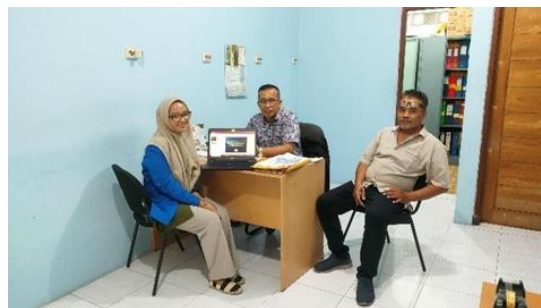
Figure 6. Discussion for the Preparation of "Service SOP"