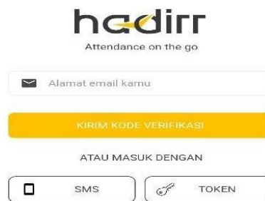
Figure 2. Employee Presence Display using Hadirr Application

Using the attendance recap form will help KSP managers monitor employee attendance and absenteeism levels. For this reason, one of the important activities that must be carried out by cooperatives is processing attendance and monitoring employee working hours so that system clarity and organizational accountability can be managed well. Apart from the use of manual recaps, this community service activity also introduces a attendance system model with a mobile presence attendance application called the "Hadirr Application". This application can help the human resources management department in monitoring and recording the attendance of its workers, especially field workers, more effectively and efficiently. Utilizing this application makes the employee attendance system efficient and easier to use anywhere.