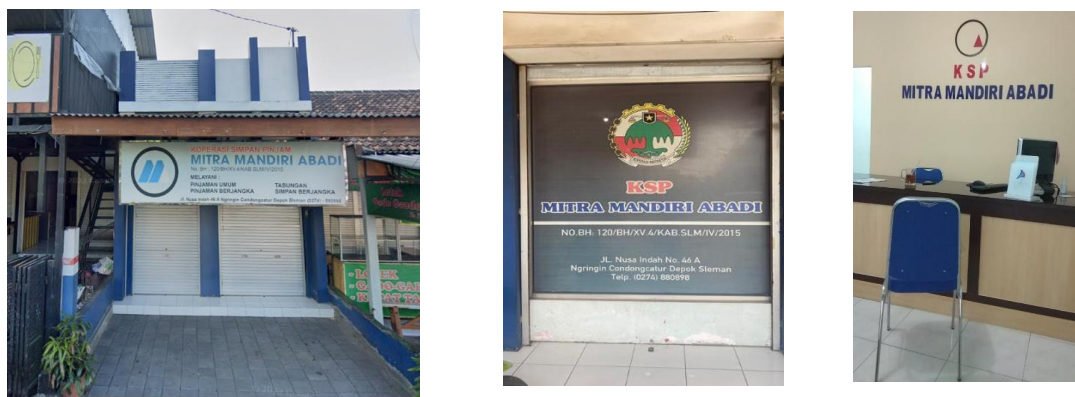
Figure 1. KSP Mitra Mandiri Abadi

One of the Savings and Loans Cooperatives which is currently quite well developed is KSP Mitra Mandiri Abadi which was founded in 2015. This cooperative is located in Jl. Nusa Indah No.46, Ngringin, Condongcatur, Depok, Sleman, Daerah Istimewa Yogyakarta. The products offered by KSP Mitra Mandiri Abadi are savings and loan. The saving products such as stock savings, daily interest savings, deposits, old age savings, education savings, education fund savings, housing savings, and cooperative office ownership savings. While the loan products offered are divided according to their needs such as home improvement loans, motor vehicle loans, productive business loans, business capital bailout loans, housing loans, negotiation loans and micro loans.