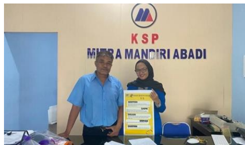
Figure 5. Submission of Service Sop Poster

The aim of this socialization is so that employees can provide the best service to cooperative service users in accordance with established procedures. Socialization of "service SOPs" can maintain consistency in the performance of KSP Mitra Mandiri Abadi management and employees in carrying out work. By providing quality services, it is hoped that it can create service user satisfaction so that it can have a long-term impact by creating user loyalty and a willingness to provide positive recommendations for prospective cooperative members to want to use KSP Mitra Mandiri Abadi services.