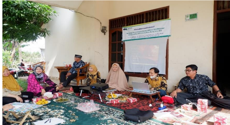
Figure 3. Submission of material on financial statements of SAK EMKM

This mentoring activity was continued by providing material on financial statements based on SAK EMKM, this was done so that before implementing the accounting system partners must gain an understanding of literacy related to the scope of MSMEs and the preparation process financial statements in accordance with applicable standards. Here's an overview of these activities.