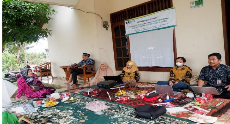
Figure 5. Implementation of the accounting system ms. Excel

The following is a "main menu" display that appears when you first open the Excel accounting system. Inside the main menu consists of several system display menus. The setup menu consists of: company profile data, chart of accounts, supplier data and customer data. Next is the inventory menu; ledger; general journals; lane balance sheet; profit and loss; statements of financial positions; depreciation; taxes; notes on financial statements and information.