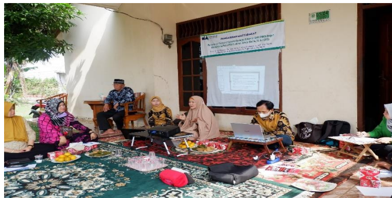
Figure 4. Delivery of material sistem accounting Ms. Excel

In the delivery of the next material regarding the manual book of the Ms. Excel accounting system, this was given for the convenience of MSME actors in using the accounting system. This system is designed simply so that partners can more quickly understand the stem to be applied in their business activities.