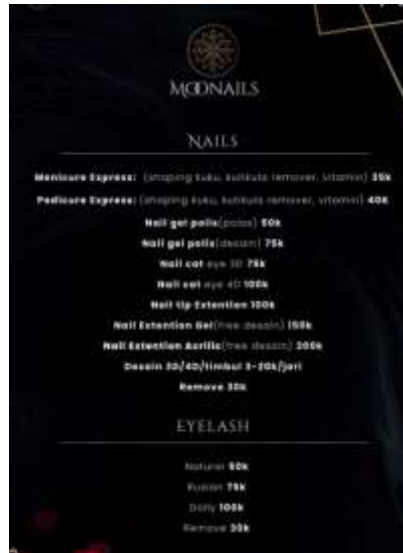
Picture .3 Product Pricelist