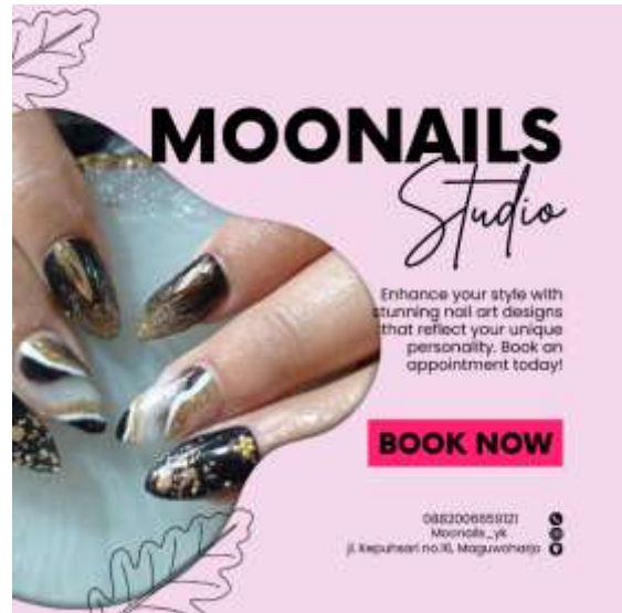
Picture .6 Canva Training Result