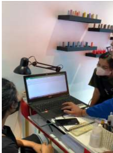
Picture .7 Time Management Training