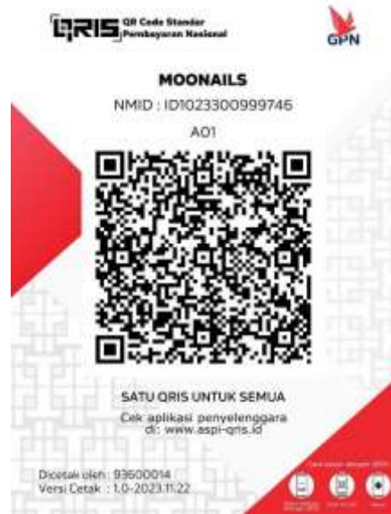
Picture .11 QRIS Result