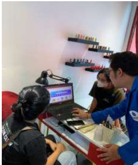
Picture .5 Canva App Training

Soft skills training using digital applications is conducted in a personalized manner so that it can help improve employees' ability to adapt to the digital era. This training process involves the use of the Canva application as a learning medium to improve employee skills. In this training, employees are taught how to use the Canva application effectively and efficiently to create designs needed to support their work. During the training process, employees gave positive feedback to the author, the author saw an increase in employee understanding of the operation of the Canva application which was growing so that the competence and ability of employees to use digital applications became the added value of employees in the company.