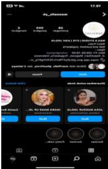
Picture.2 Instagram Moonails