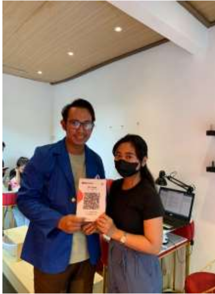
Picture .10 QRIS Creation