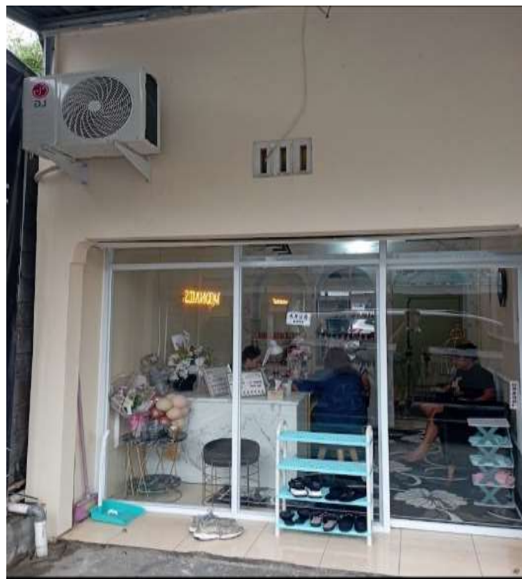
Picture .1 The Location of Moonails