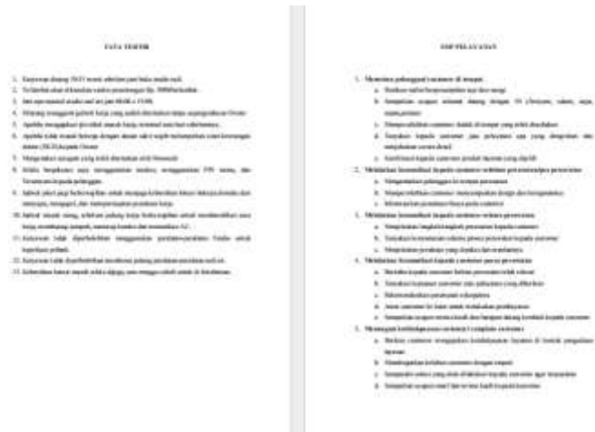
Picture .9 Company SOP