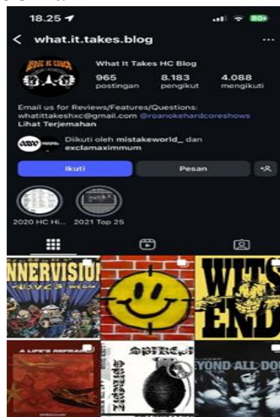
Figure 1. Instagram account screenshot @what.it.takes. Blog

The development of this fast-paced digital era has resulted in various social media platforms such as Instagram having become one of the crucial tools in the dissemination of information. For example, on the international Instagram account @what.it.takes.blog which is used to share information related to music that focuses on hardcore music and has a larger following, actively building connections with local and international communities through the promotion of music releases and live performance documentation. In Indonesia, similar accounts have also begun to be created and it is no exception in Cirebon City. Where Cirebon is known as a city with a strong traditional culture and religious nuances, and has local and religious values that still greatly influence information and entertainment consumption patterns. It is not easy for all cultures to enter this region, but with the ease of information exchange in this digital era, it has begun to shift.