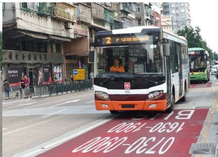
Figure 11. Riverside New Street Pedestrian Overpass to Mage Temple