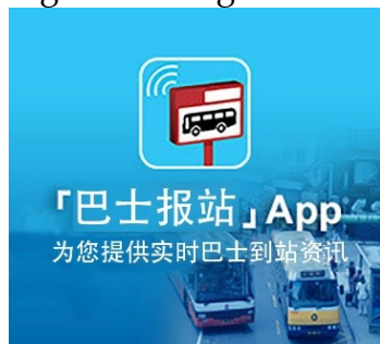
Figure 1. Bus Stop Announcement App

Macau's public buses originated in 1919. Until 2010, Xinma road first implemented the "bus lane". In 2011, the Macau government adopted the government led approach, mainly adopting the "government led, market operation" approach to operate services, so as to reasonably ensure the safety of citizens. In 2016, the "bus stop announcement" app was launched, which allows real-time query of waiting stations and prediction of congestion every ten minutes within 60 minutes (Figure 1-2); In terms of civil air defense, you can also check the refuge center, but it is concentrated in the old urban area of Macau, and the number of roadside areas off the island is small. The study found that the bus routes departing in front of the yamala on the Macau Peninsula are the most, and the least is the University of Macau; Route 26a has the highest mileage and the largest number of stations.