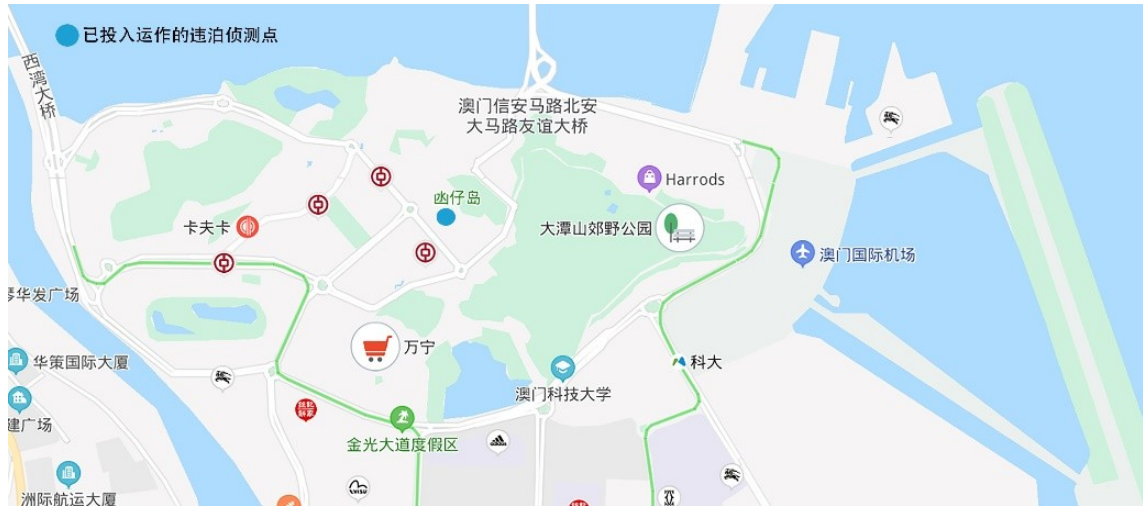
Figure 13. Setting Points of Illegal Parking Detection Station