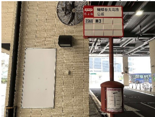
Figure 5.No Platform at Butterfly Valley Road Bus Station

5-6); The failure to maintain the canopy of some bus stops regularly also led to rust and water leakage in rainy days (Figure 7).