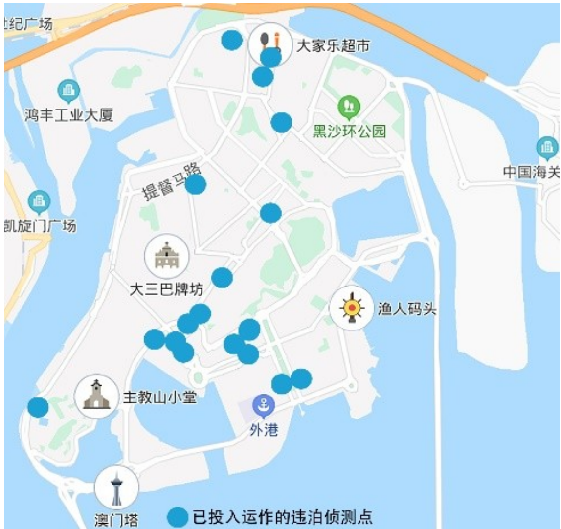
Figure 12. Setting Points of Illegal Parking Detection Station

At the same time, it is necessary to strengthen the coverage of the construction of intelligent transportation system in Macau. In view of the traffic congestion in the old urban area of Macau, and even the phenomenon of private vehicles parked indiscriminately, Macau has set up multiple illegal parking detection systems in the old urban area, while only one system point has been set up in the outlying island, and there is no such system in the more remote roundabout island; An integrated intersection detection system and a red light detection system are also set up in the old urban area. There is no such system in the second island of Lu'an, and the overall coverage of the three is small. The coverage of the old urban area should be expanded, and the areas that can be parked and opened to traffic should be equipped with detection systems to avoid the phenomenon of private car residents parking and misplacing randomly; The detection system should also be gradually installed on the two islands of Cotai to achieve the coverage of the whole administrative region of Macau.