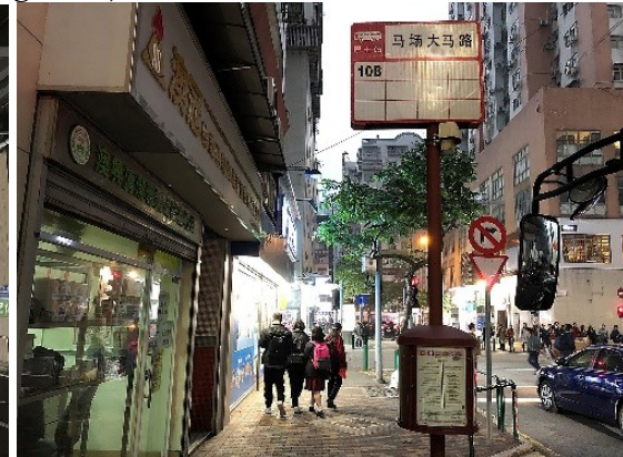
Figure 6.No Platform at Machang Damau Bus Station