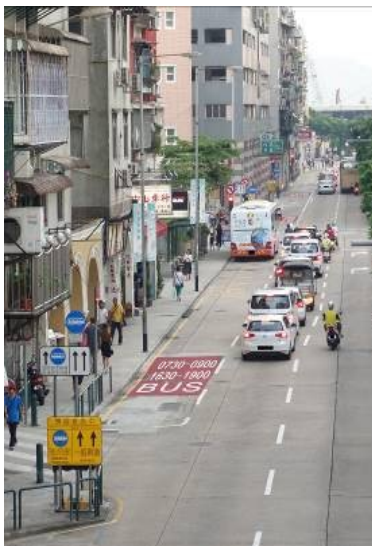
Figure 10. Bus Lane Practice

On the other hand, bus lanes should be added near major traffic locations in the city, such as schools in the old urban area of Macau, high-density residential areas and popular shops, so as to reasonably form a bus lane network system. Public transport lanes should be divided into perfect signs, markings and other identification systems, so that they can be clearly visible to ensure that pedestrians and car owners can see them. In particular, it is necessary to strengthen the monitoring of public transport lanes and the punishment of violations, truly achieve "dedicated lanes", and improve the running speed and punctuality of public transport vehicles (Figure 10-11).