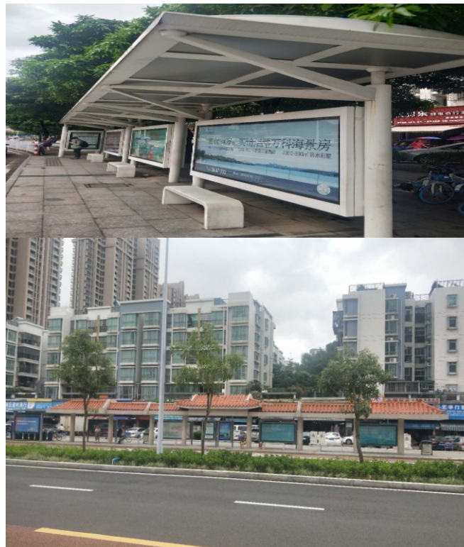
Figure 9. Platform Setting Reference

Learn from the proportion and setting methods of mainland bus stops, set the distance between stops and intersections, reasonable station spacing, website location and land area according to Macau's urban planning norms, pay attention to the planning of bus stops, and increase the length and depth of the stops. Bus waiting points with no stops for high-frequency use should be set with stops to ensure that people can wait orderly in summer and rainy days (Figure 9).