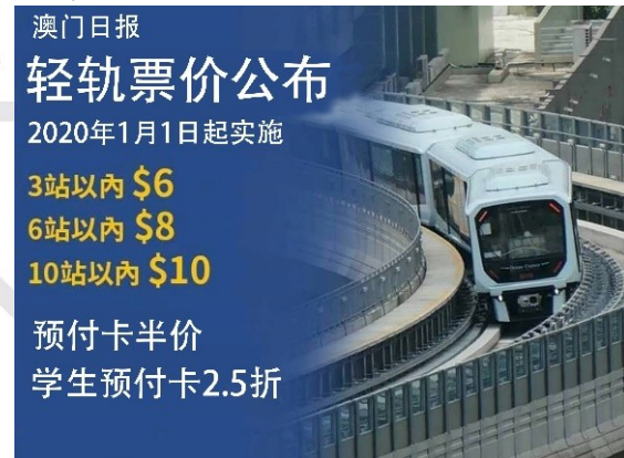
Figure 4. Macau Light Rail Fares