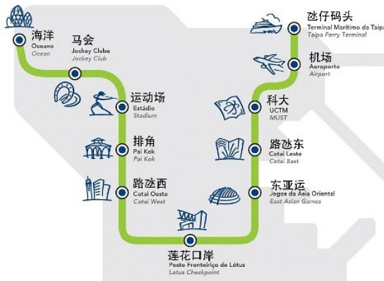
Figure 3. Route Map of Macau Light Rail Taipa Line

with a total length of 9.3 kilometers, covering Taipa's main residential areas and sea, land and air transportation ports (Figure 3); From the comparison of ticket prices, the charge is mop 6 within three stops, mop 8 within six stops and mop 10 within ten stops (Figure 4). However, according to the latest display on Macau light rail official website, in order to cooperate with the cable replacement project of the whole line, the passenger service of Taipa line of light rail will be suspended from October 20, 2021.