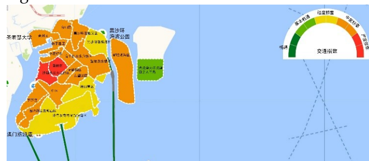
Figure 2. Real Time Traffic Situation in Macau - Congestion Coefficient Data Source: http://mrw.so/5taRog Self drawing after interception