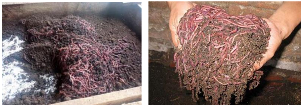
Figure 1. Worm Cultivators

However, despite these positive developments, Micro, Small, and Medium Enterprises (MSMEs) in Indonesia continue to face multifaceted challenges in capitalizing on the opportunities presented by international trade. One of the primary challenges lies in optimizing the work capability, leadership style, and work motivation within these enterprises to enhance their performance in the context of internationalization. Studies have shown that the effectiveness of MSMEs in navigating the complexities of global markets is closely linked to the proficiency of their workforce, the leadership approaches adopted by their management, and the level of motivation exhibited by their employees (Jones et al., 2021; Smith & Brown, 2022).