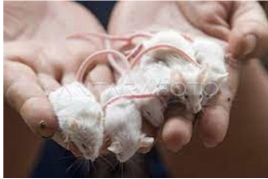
Figure 2. Laboratory white rat