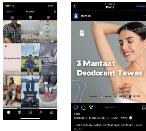
Figure 5. STORD reels and carousel content

The language used by the brand is relaxed and modern. The sentence "may not mimin titip one" shows a brand personality that seems relaxed and flexible. Apart from the language style used, the brand personality is also evident in the content available on STORD's Instagram account