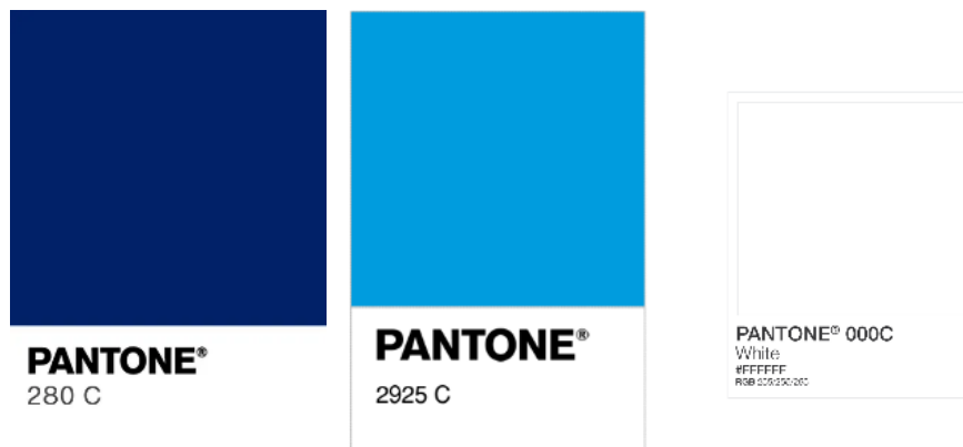
Figure 3. STORD collar Pallete