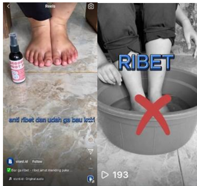
Figure.6 Content reels stord about tips and tricks

In an effort to build this reflection, STORD presents content such as tips and tricks from problems that may be experienced by people who are active.