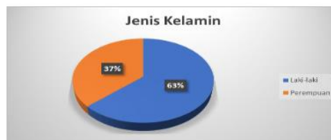
Figure 1. Distribution of Data by Gender

Respondents based on gender can provide differences in a person's behaviour, which can often be a differentiator in the activities carried out by individuals. Based on figure 1 shows that respondents when viewed by gender are dominated by male employees as many as 19 respondents (63%) because their field of work is related to the field. However, there are 11 respondents (37%) female employees in PT. Karya Kasih Sentosa which in general female employees are more allocated for company administration positions.