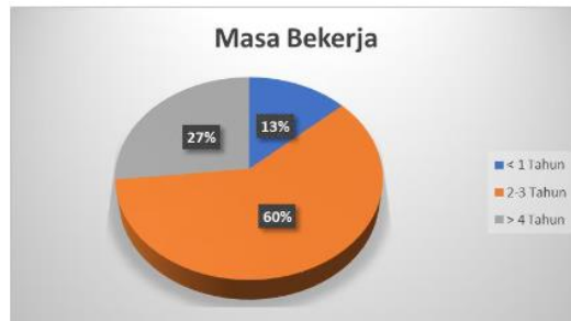
Figure 3. Data Distribution Based on Length of Service

Respondent Characteristics Based on Length of Service in a Company as a condition that reflects a person's loyalty to their job. Presentation of data from 35 respondents based on education as seen in Figure 3 below: