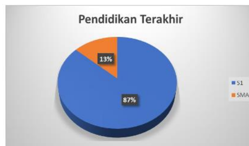
Figure 2. Data Distribution Based on Last Education

Respondent Characteristics Based on Last Education Presentation of respondent data based on education is as shown in Figure 2 below: