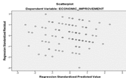
Figure 2. Heteroscedasticity Test

Heteroscedasticity test can be done with scatterplot charts. Through graph analysis, a regression model is considered to result in No Heteroscedasticity if the points spread randomly and do not form a certain pattern that is clear and spread above or below zero on the Y axis.