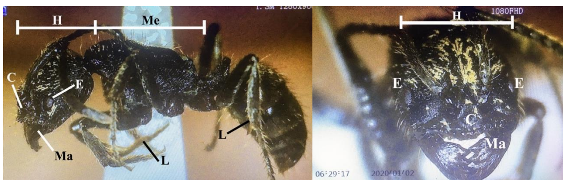
Figure 2. (A) Lateral view and (B) head of Odontoponera sp. showing morphological features: (A) C-clypeus, E-eye, H-head, L-leg, Ma-mandible, Me-Mesosoma