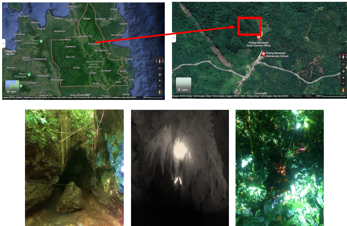
Figure 1. Map of Prosperidad, Agusan del Sur with the study site, Puting Buhangin Cave (top photos); cave entrance, stalactites, and the vegetative part on top of the cave (bottom photos, left to right)

gather ant species. Tuna (protein), peanut butter (carbs), nuts, and dead insects attracted trophic generalists and those with specific diets. Baits were put on paper platforms to attract dominant species, while oil beneath and surrounding the paper attracted less aggressive ants (Agosti et al. , 2000). The baiting strategy lasted 60–90 minutes since dominant species may find and recruit baits in this period. Pitfall traps were loaded with propylene glycol in 5.5-cm polypropylene cups. A few drops of unscented detergent weakened surface tension, preventing ants from escaping the traps. Traps were placed with little surface disturbance. Hand-reposition gritty sand, stones, and leaf litter were done. Digging was done with a little hand shovel. To better catch ants, traps were buried with their lips level with dirt or leaf litter. After placing the traps, free-roaming ants were hand-collected for 5 minutes at each location using a trimmed paintbrush. These methods assessed ground-foraging ant composition and richness (Bestelmeyer et al. , 2000). According to Pag-ong et al. , (2022) ten collecting locations (5 baits and 5 pitfall traps) with a 10-meter minimum spacing for each subpart were used.