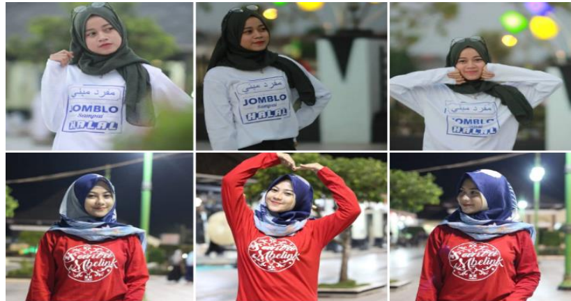
Picture 4. Female Students Become Brand Ambassadors

The picture above is how the media utilizes or exploits female students in the context of marketing or promoting products or services. Female santri are used inappropriately or unethically in advertisements with the aim of gaining attention or commercial gain. Content that shows the charm of their faces and beautiful curves. Utilizing their private photos without permission, or exploiting their body image to gain attention or popularity online. It can also involve verbal abuse or harassment in comments or messages directed at women.