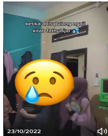
Picture 6. Female Students Finish Reciting the Book