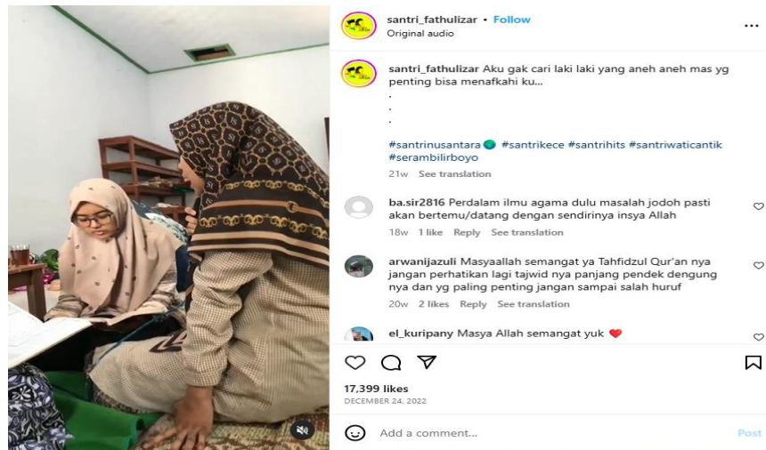
Picture 1. Video of Female Students Listening to the Recitation of the Qur'an

On social media, especially on Instagram, there are many accounts whose usernames are on behalf of "Santri" such as the santri_fathulizar media account with the hashtag #santriwaticantik and given captions that have nothing to do with the reality of the images posted.