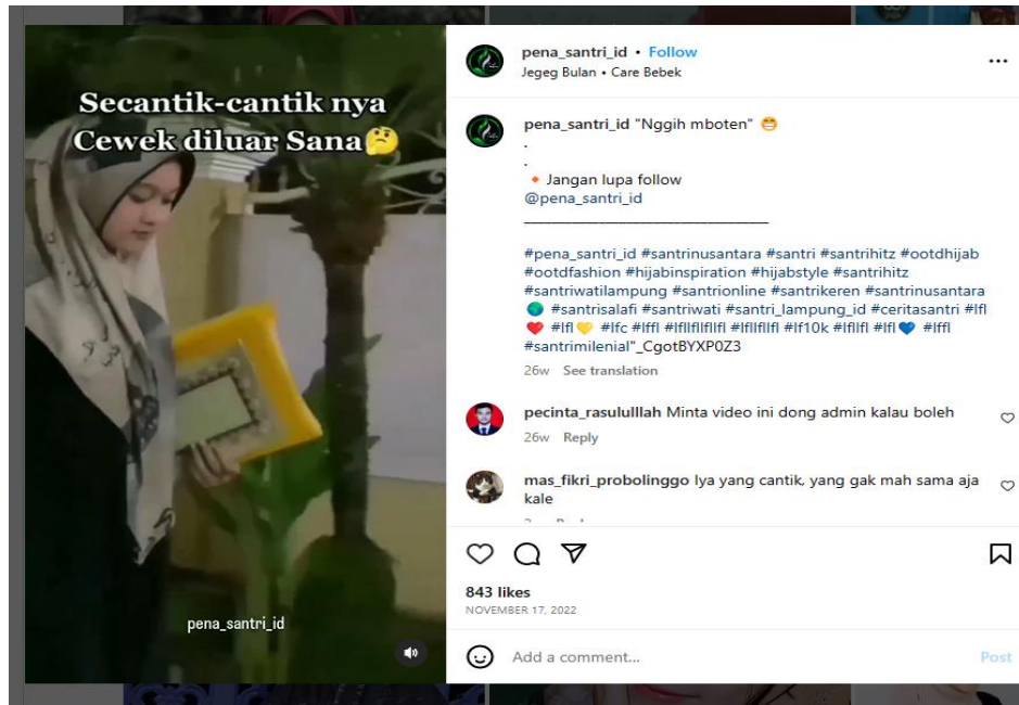
Picture 3. Female Students from the Dormitory to the Place of Study

Exploitative content such as in the image above harms female students directly by violating their rights, demeaning their dignity, and resulting in negative impacts on their physical, mental, and emotional well-being. In addition, this kind of content can also adversely affect society's perception of female santri in general, creating a negative stigma. In addition, the above content becomes Cyberbullying: i.e. discriminating, intimidating, or harassing female students indirectly (online). This can cause serious psychological and emotional harm to them.