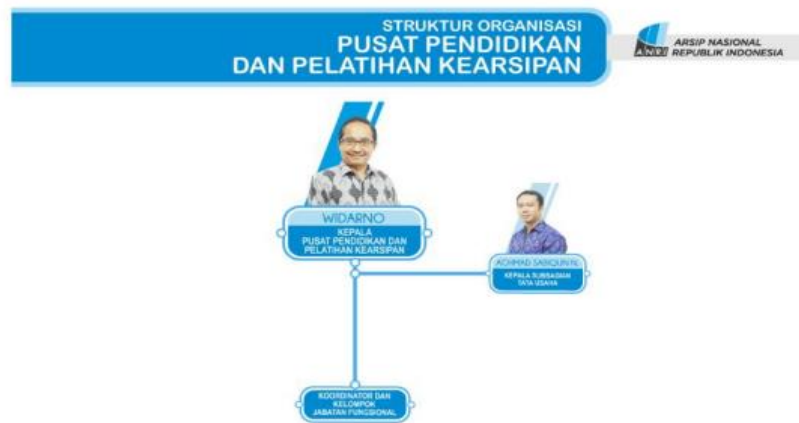
Figure 2. Structure of Organization

The implementation of the archives training program has been supported by sufficient human resources both in terms of number (32 people) and quality (qualifications and competence), and also expressed the need for additional staff in the future.