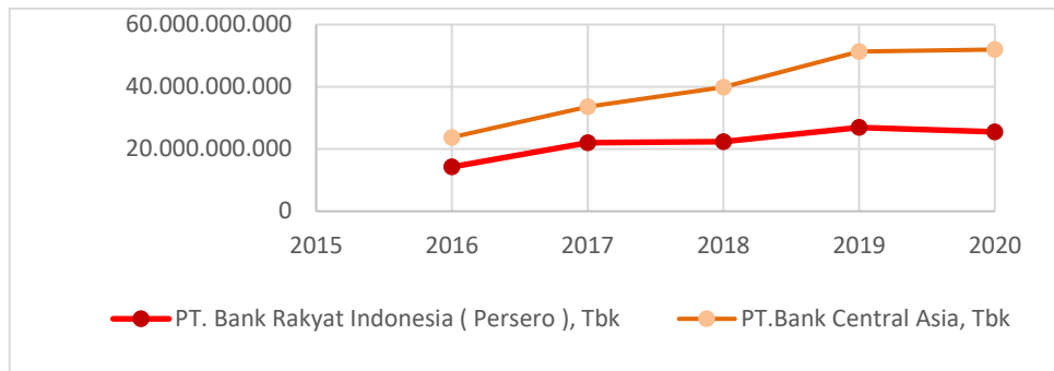
Figure 3. Calculation of Market Value Added (MVA)

If seen from the graphic image, it can be concluded that the MVA value at PT. Bank Rakyat Indonesia (Persero), Tbk has increased in the last 4 years resulting in an MVA value > 0