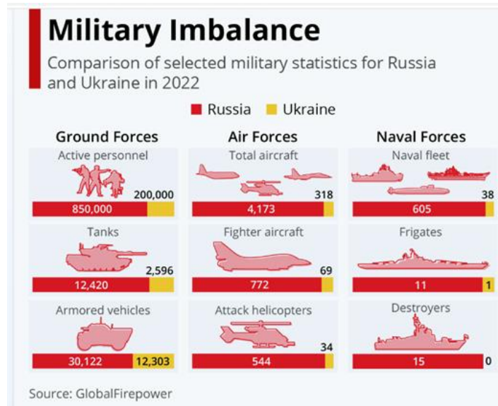
Figure 2: Russia-Ukraine Military Imbalance, Source: GlobalFirepower

Because the Russia-Ukraine conflict happens at the soil of Ukraine, Ukraine civilians suffered greatly. However, Russia experienced a lot more loss compared to Ukraine in terms of military equipment, such as shown in Figure 3 that informs trucks, vehicle, jeeps; infantry fighting vehicles; armoured fighting vehicles; anti-tank missiles; and helicopters and aircraft since the military operation began up to 14 March 2022.