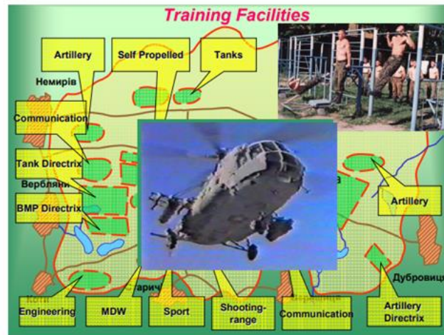
Figure 4: Training Facilities in Yavoriv, Ukraine

Defense Education Enhancement Program (DEEP): The DEEP initiative was created in 2007 as part of the larger NATO Partnership Action Plan on Defense Institution Building (PAP-DIB) of 2004. The intent of DEEP is to lead host nations to enact and effect security sector reforms as a way to integrate Western military and defense management practices. This program aimed to enhance the quality and professionalism of Ukraine's military education system. It involved collaboration with NATO member states, offering expertise and resources to support the modernization and development of Ukraine's defense education sector. (Pierre Jolicoeur, 2018), By some accounts, NATO has not done much in support of Ukraine. But DEEP Ukraine has been the fastest growing initiative within the program, a testimony to the desire of the Ukrainian leadership in seeking Western help – and presence. Ukraine formally requested a DEEP program from NATO in October 2012. A feasibility study conducted in March 2013 officially launched the program. The revolutionary crisis interrupted the program almost immediately, but resumed in late 2014, doubling in size from what had been previously planned. To meet the added activity load, NATO enlisted the support of the PfP Consortium. In 2015, there were 66 Ukraine DEEP events planned, up from 14 in 2014. In 2016, 76, and as many in 2017. However, not all events were executed, the first indicator of overstretching.