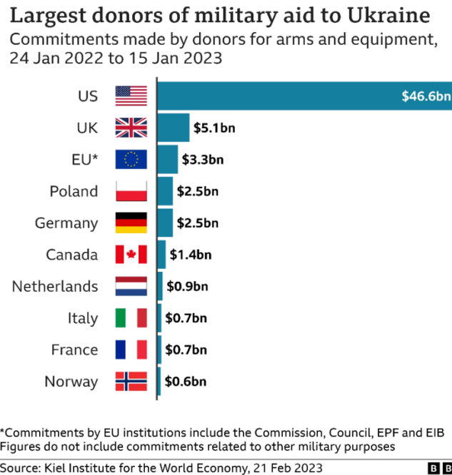
Figure 5: Largest Donors of Military Aid to Ukraine

makes sense given that most of the military materiel Ukraine requires belongs to the nations and not the alliance (Dempsey, 2022).