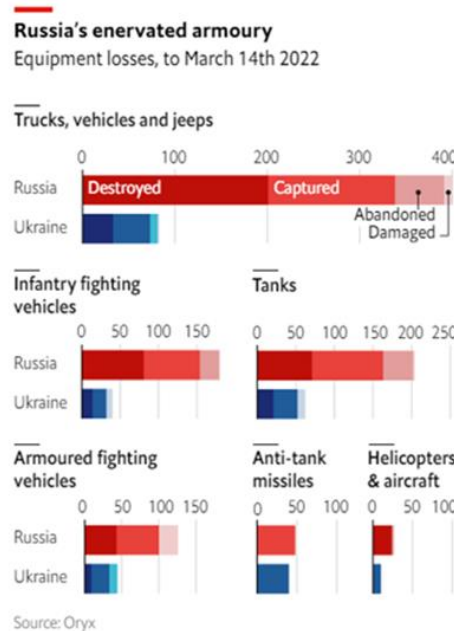
Figure 3: Equipment Losses up to 14 March 2022

Because the Russia-Ukraine conflict happens at the soil of Ukraine, Ukraine civilians suffered greatly. However, Russia experienced a lot more loss compared to Ukraine in terms of military equipment, such as shown in Figure 3 that informs trucks, vehicle, jeeps; infantry fighting vehicles; armoured fighting vehicles; anti-tank missiles; and helicopters and aircraft since the military operation began up to 14 March 2022.