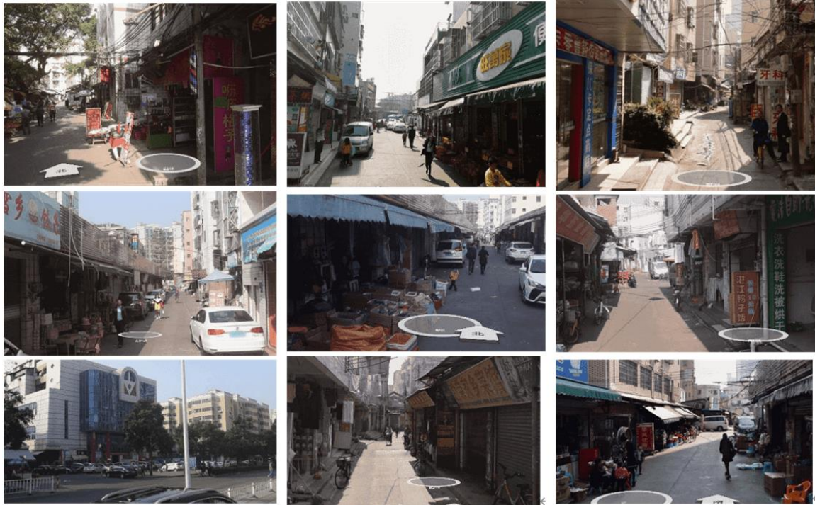
Figure 6 distribution of business types in Cuiwei Village

and competition because the merchants settled for the purpose of urgently needing profits, The characteristics of the store are not obvious, and the change of cultural and creative industries is not obvious. There is little room for growth. There are no advertising companies, wedding photography companies and other diversified forms of business settled in Cuiwei village or Cuiwei historical block built later (Figure 6).