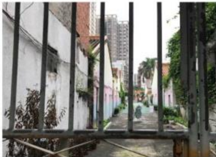
Figure 3 Cuiwei kindergarten