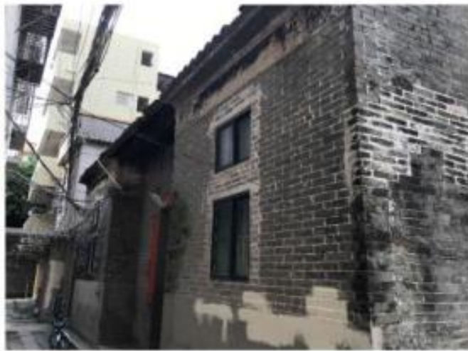
Figure 2 side of No. 4 folk house, erheng lane, Binlang Street

At present, in the protection of villages, due to the imperfection of corresponding laws and regulations, the planning, management and construction of villages are relatively poor. Although Cuiwei historical block has rich folk houses, temples, ancestral halls, ancestral halls and other human landscape resources, at present, the cultural connotation of Cuiwei historical block is shallow, the development is insufficient, and many farmland in the village is also idle. The tourism theme is relatively vague. In the increasingly fierce ancient village In the tourism competition of the ancient city, the strength of tourism brands is insufficient (Figures 2 to 4).