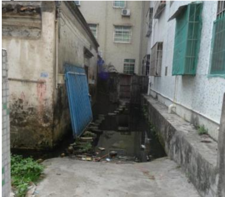
Figure 5 current situation of drainage facilities in Cuiwei Village (Image source: the author intercepted from the summary of the renewal planning of the reconstruction project of Cuiwei old village in Xiangzhou District, Zhuhai in 2019)

At first, foreign businessmen settled in Cuiwei village, mainly engaged in manufacturing, textile industry, morning and evening markets, and served the villagers of Cuiwei village. At that time, prices were low, and their profit-making purpose was weak. The stall at night was also to provide a platform for workers to eat dinner and have a late night snack. Subsequent merchants settled in, with strong purpose or profit-making nature, they did not pay attention to the environment in the workshop, so it was easy to cause environmental problems, No planning has been made for public areas, and the discharge of catering and domestic sewage has not been well solved.