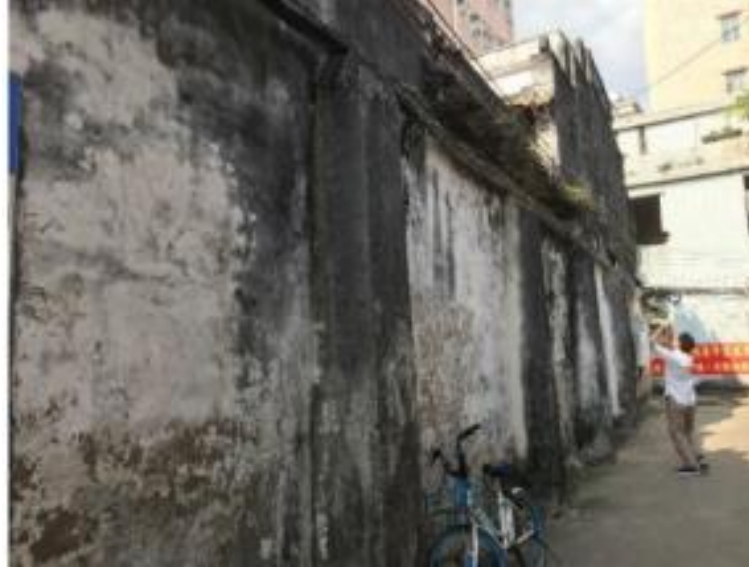
Figure 4 gable of Webster Mansion