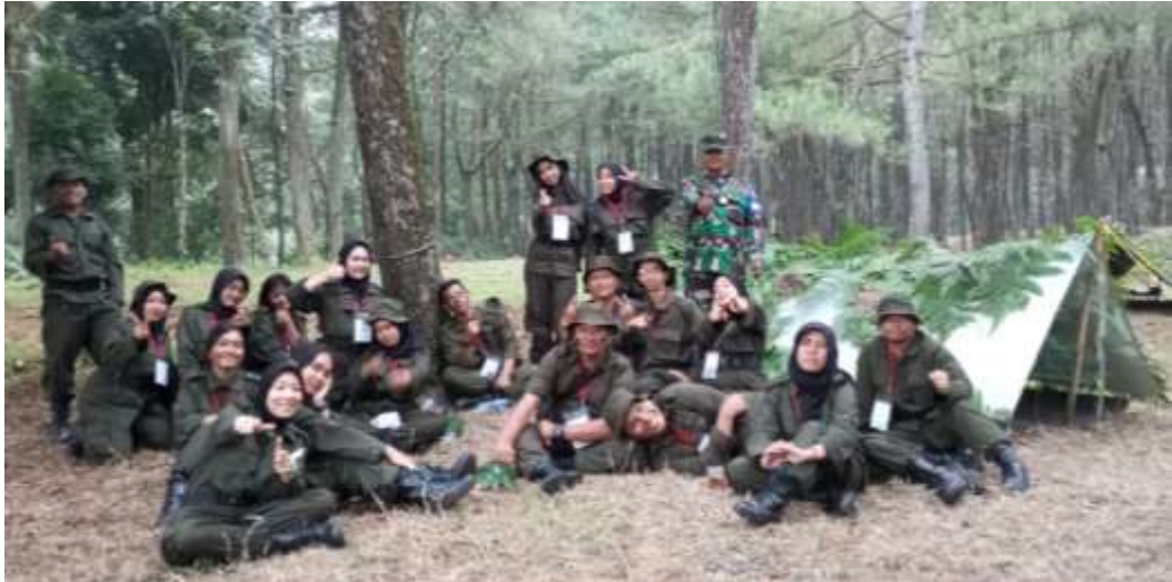
Figure 6. Teamwork and Discipline