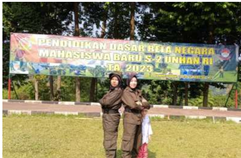
Figure 5. Basic Education for State Defense New Students S2 Unhan

This material discusses the history of the struggle of the Indonesian nation in defending the independence and sovereignty of the country, as well as the importance of defending the country in building character and love for the homeland in the younger generation.