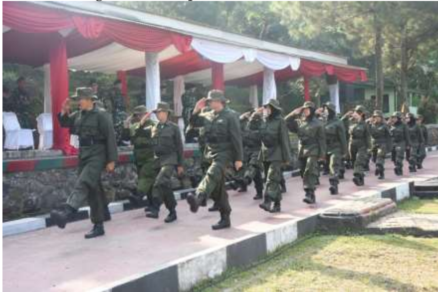
Figure 8. Defile Exercise

This material discusses basic military skills, such as flag-raising procedures, marching, and salute procedures.