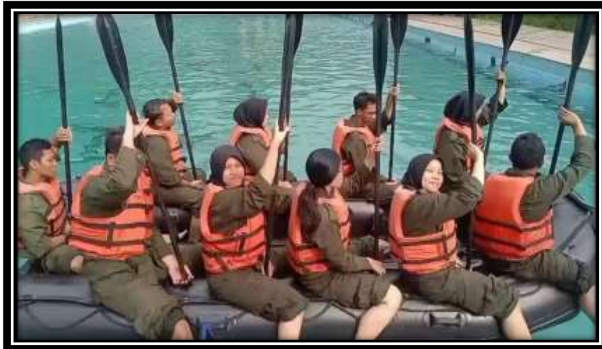
Figure 9. Water Rescue Exercise

This material discusses the importance of preparedness in facing natural disasters and how to prepare in facing emergency situations.