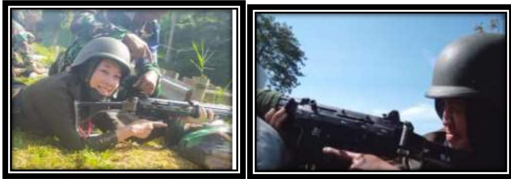
Figure 10. Basic Shooting Exercises Source : Processed by author, 2023