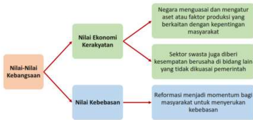
Figure 3. National Values Originated from Pancasila in the Reform Era