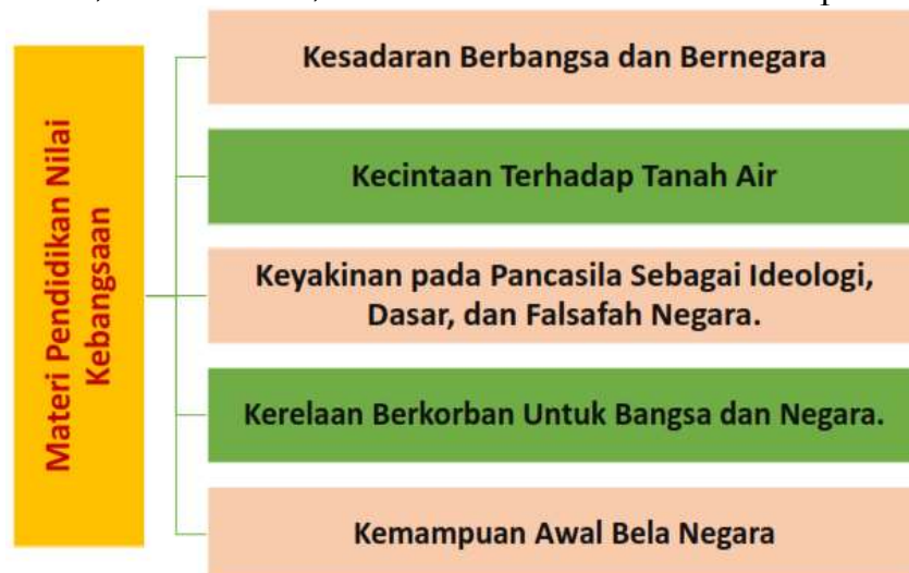
Figure 4. National Value Education Material

This research highlights the importance of early education of national values, both through formal and non-formal education. Education of national values is not only the responsibility of educational institutions, but also needs to involve families, communities, and mass media as educational partners.