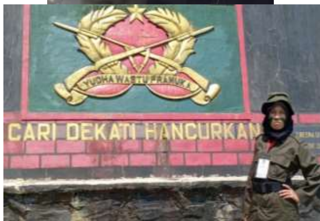
Figure 7. Leadership Training by becoming Chairman