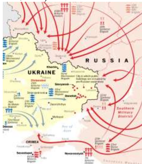
Figure.1 Map of Russia and Ukraine