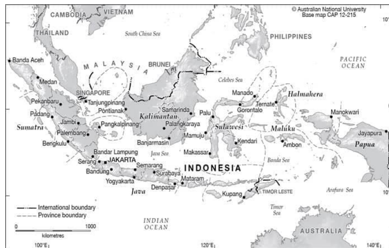
Figure.1 Map of Indonesia's Territorial Borders with Neighboring Countries

Based on Law (UU) Number 43 of 2008 Article 5 concerning State Territory, Indonesia has direct land borders with three countries, namely: Malaysia, Timor Leste and Papua New Guinea. This means that Malaysia, Timor Leste and Papua New Guinea have land areas adjacent to Indonesia. The border between countries is formed by the land line that separates the two regions of the country. These three neighboring countries play a very important role in all regional political, economic and security dynamics with Indonesia.