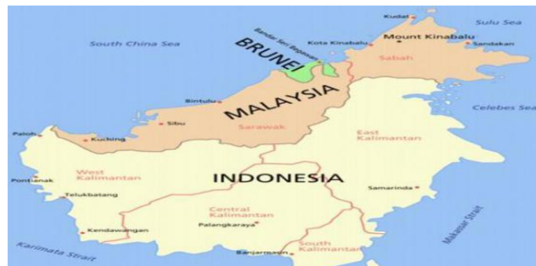
Figure.2 Republic of Indonesia Territory Border Map with Malaysia