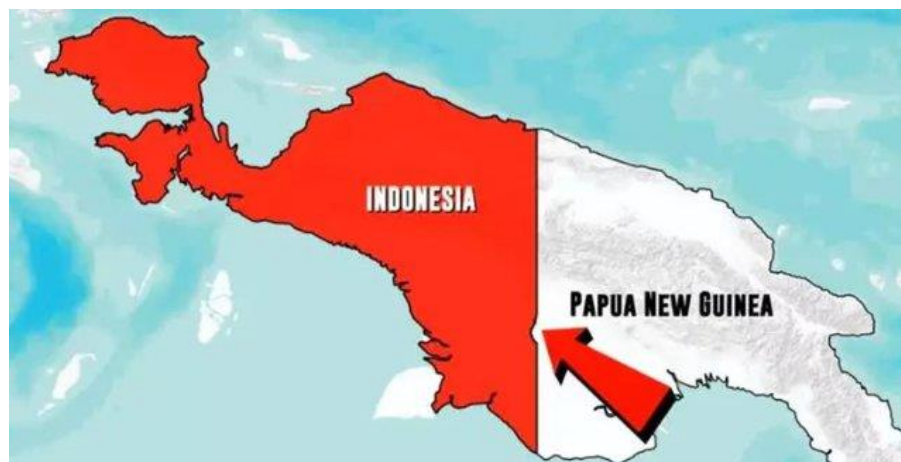
Figure 4: Map of the Republic of Indonesia's territorial borders with Papua New Guinea

The degree of interaction or intensive relationship orientation with neighboring countries even has a tendency to experience dependence on each other, especially in meeting daily needs and buying and selling transactions. Most opinions or research results reveal that on average border areas are underdeveloped (Syahid, 2019). With conditions like this, people in border areas have the ease of interacting with citizens of neighboring countries. It is feared that this condition could weaken the nationalism of Indonesian people living on the border.