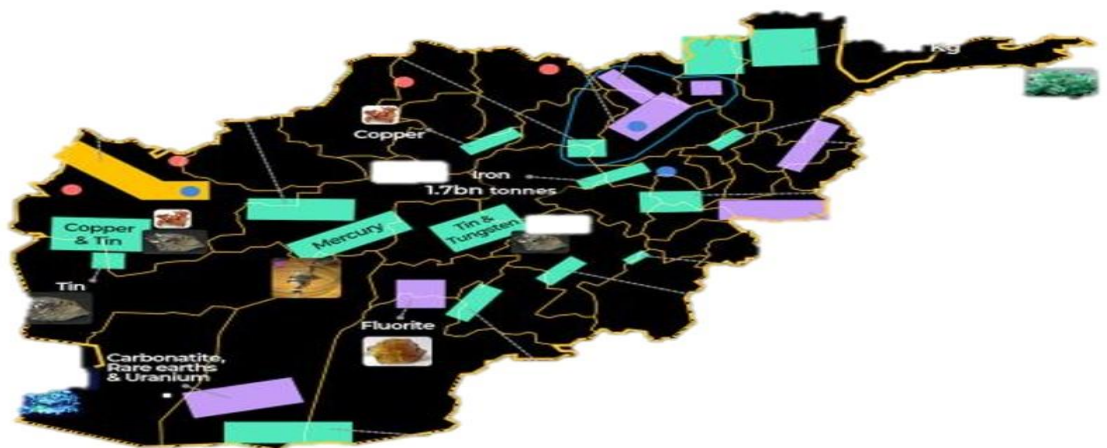
Figure 1-Mapping Afghanistan's untapped natural resources

Significance of the Research: This study focuses on examining the sustainability of Afghanistan's natural resources and underscores its importance for the economic, social, and environmental development of the country. By employing analytical methods and strategic theories, this research identifies and evaluates the factors influencing the sustainability of natural resources. The significance of this study lies in guiding decision-makers and relevant organizations in Afghanistan towards creating effective strategies for natural resource utilization.