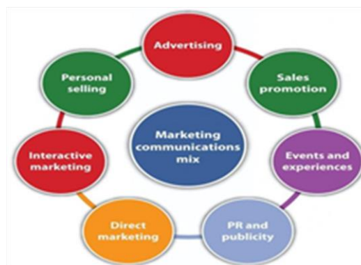
Figure 2. Integrated Marketing Communication Models

The main requirement for the success of a promotional program is the linking of the marketing communication mix with the delivery of a number of