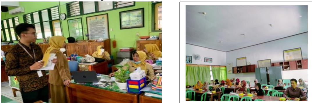
Figure 8. Routine Socialization of Bukopin in Agencies

The purpose of interaction with one or more prospective buyers is to create presentations, answer questions, and procure orders. One of the things that is often done by the Madiun branch, especially the pension credit division, is to carry out routine outreach activities. This socialization activity is often held in an association of more than ten people, participants who attend can also ask questions to the marketing that is in the socialization moment.