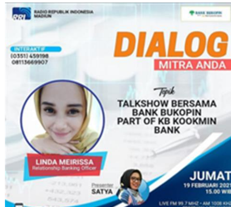
Figure 6. Image Interactive dialogue with RRI Madiun partners

Various programs created to promote or protect the image of the company or its individual products. Common activities are in the form of talk shows or seminars, collaboration or cooperation. In order to dampen the widespread crisis issue, Bank KB Bukopin Madiun Branch is collaborating with the mass media, the media that is partnered with is also the media that is collaborating with the government, namely RRI.