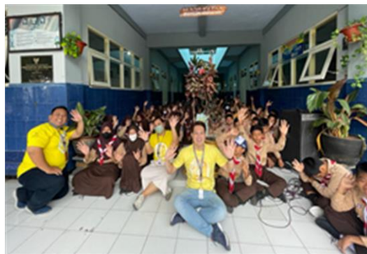
Figure 4. Socialization of SIMPEL SMPN 2 School Savings

A variety of short-term incentives to encourage trials or purchases of products or services. Examples include games, sweepstakes, contests. In this case Bank KB Bukopin Madiun Branch carried out a strategy of holding a poetry reading and composing contest for participants in one of the elementary schools in Magetan City. The purpose and objective of holding the competition is to attract the interest of prospective debtors who are retired teachers from the elementary school. It was proven that several prospective retired teachers made credit disbursements at the Madiun Branch of Bank Bukopin. Besides that, Madiun is also a pioneer for other branches to create a similar concept.