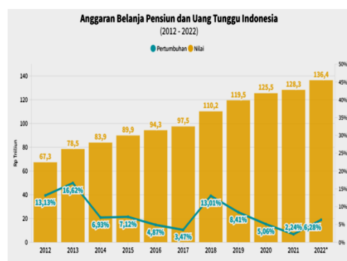
Figure 1. Indonesian Pension Budget and Waiting Money

The government also contributes to the welfare of retirees and makes them potential people. One form of support is in the form of material funding. Data from the Ministry of Finance explain that , spending budget for pensions and waiting money for civil servants (PNS) is IDR 136.4 trillion in 2022. This amount has increased by 6.28% compared to the previous year's realization of IDR 128.3 trillion. They are expenditure itself is a budget prepared in the APBN to pay pensioners. While the waiting money is the budget for civil servants who will be honorably discharged from their positions.