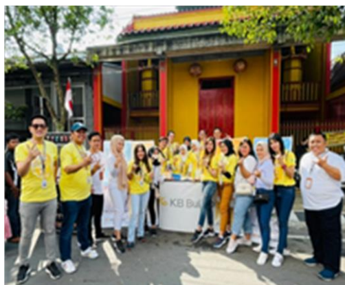
Figure 7. Direct marketing at CFD events

Examples include annual reports, exhibitions and trade. Direct marketing or direct exhibitions are efforts made by industries or companies or organizations to communicate directly with prospective target customers with the intention of creating a response or a sales transaction. In this case, Bukopin Madiun Branch conducted direct outreach at the Car Free Day event in the Magetan area. The form of Bukopin's existence in the midst of the crisis issue that occurred was by being directly present in the midst of the people who were carrying out their activities.