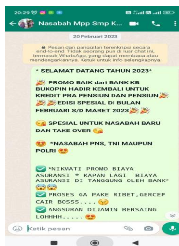
Figure 3. Broadcast Marketing Retirement Loans to Prospective Debtors