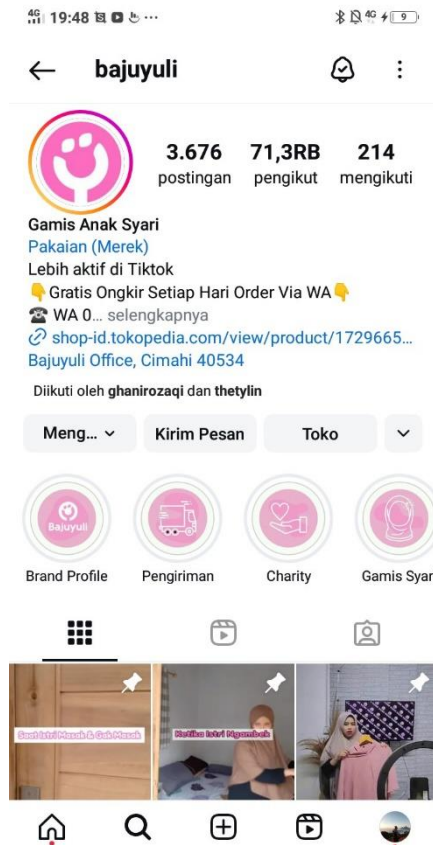
Figure 2 @bajuyuli account after recovering from a hack

depth explanation of the hacking incident, including the chronology of the incident, the impact caused, and the concrete steps that have been taken to prevent the problem.