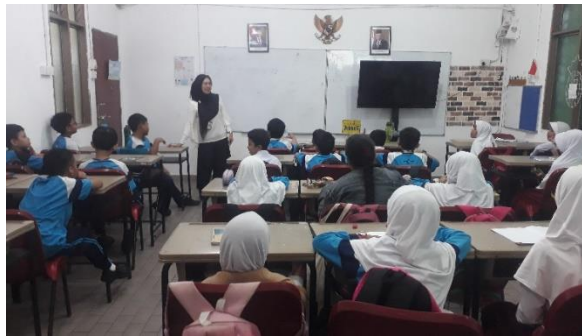
Picture 1. Documentation of English Language Learning Observations in Fourth Grade

The research results stated that the Total Physical Response (TPR) method was used as an introduction to optimizing the ability to master vocabulary and speak English according to correct pronunciation. Based on the data obtained, it was stated that 30 out of 34 students were able to speak skillfully by adjusting their abilities from beginner to advanced level. Only 2 students still don't speak English because they only just discovered English in class IV so they need full special guidance from a direct English teacher. These observations are assessed through teacher and student observation sheets, making it easier for researchers to manage the data and research sources obtained.