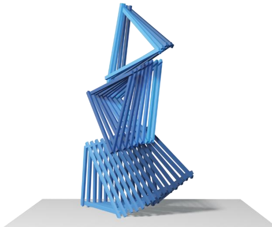
Figure 1. Installation Art Concept

From the above keywords, the conceptual form can be observed in the following illustration: