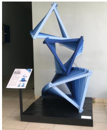
Figure 3. Implemented Process for Creating Installation Arts