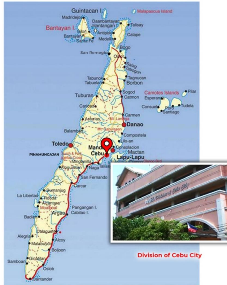
Figure 2. Division of Cebu City