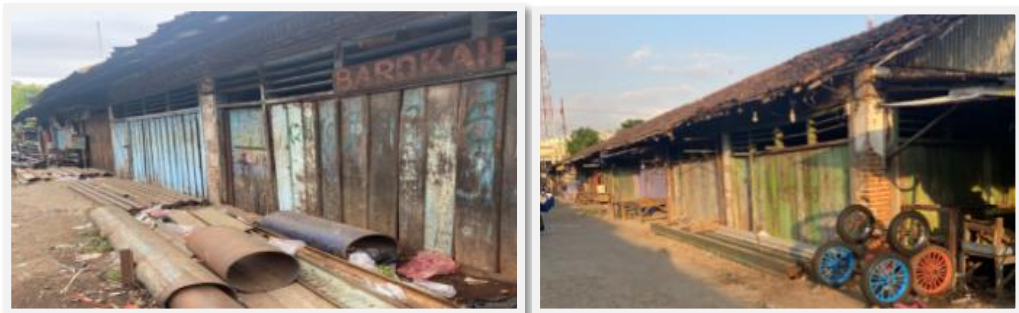
Figure 1. The Picture Above is the State of the Iron Market Block in Setono Betek Market which was Covered in Total for Two Weeks During PPKM

Seen as the picture above is a portrait when the implementation of emergency PPKM is carried out. The block area of the scrap metal market in Pasar Setono Betek, Kediri City, the entrance access is completely closed. Di in the market also the stalls of these iron vendors are all closed and seem deserted there is no buying