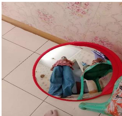
Figure 6. Convex Glass installed at Road turns

practices regarding health and hygiene. Then, Local Economic Empowerment, which is an effort to improve the community's economy, KKN students can hold skills training such as handicrafts, digital marketing, household financial management, and local product development training. The goal is to encourage the people of Sukadamai Village to be more independent and creative in developing their economic potential. Lastly, Village Infrastructure Development, where students are involved in physical projects, such as the construction or repair of public facilities (village roads and playgrounds), the creation of patrol posts, and the improvement of education and health facilities.