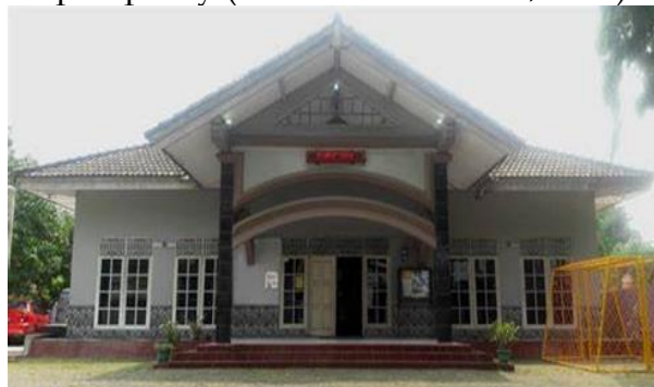
Figure 1. Sukadamai Village, Cikupa, Tangerang Regency

Sustainability has become an important global agenda in the face of climate change, resource scarcity, and environmental degradation. One approach to achieving sustainability is through green collaboration, which combines efforts from various sectors to strike a balance between economic growth, social justice, and environmental protection (Senge, 2008). The principle of "learning, empowerment, and prosperity" is an important pillar in creating a more sustainable community, where every member of the community has the opportunity to learn and develop, be empowered through active participation, and achieve common prosperity (Robinson & Berkes, 2010).