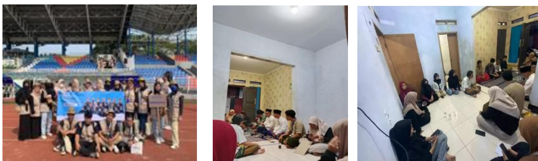
Figure 4. Opening of KKN and Thanksgiving with Community Leaders Desa Sukadamai Kecamatan Cikupa Kabupaten Tangerang