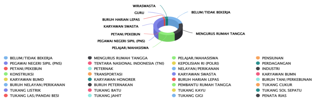
Graph 3. Statistics of Employment in Sukadamai Village, Cikupa District, Tangerang Regency