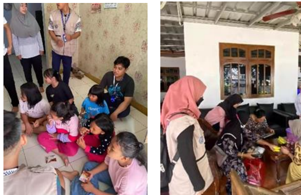
Figure 5. Learning through game and quiz methods as well as Village Stunting Data Collection

So, don't feel embarrassed if you can't always keep up with current trends. It doesn't hurt to have a unique personal style and forget about everything that is trending right now. It's best to stay yourself and express it in a way that makes you feel comfortable and happy. Match the trend to your personality, and let yourself be the center of attention, not the trending trend. Unity to identify existing needs and problems. Furthermore, coordination with the Village Government, after the survey, coordination with the village head and other village officials is carried out to formulate a work program that is to the needs of the community. This work program is also adjusted to the KKN theme set by UMT.