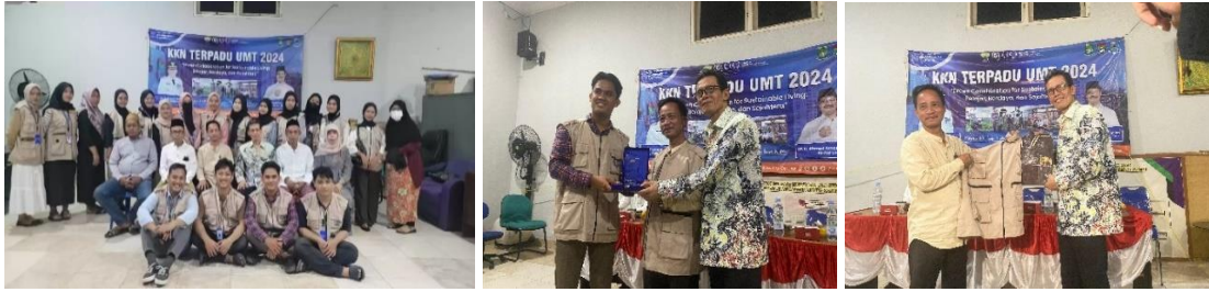
Figure 7. Giving of Jackets, Vests, and Vandles at the 2024 KKN Recruitment Event on August 24, 2024

Fifth, Impact and Sustainability , namely Increasing Public Awareness Through various programs, the community is expected to gain a better understanding of the importance of education, health, hygiene, and economic skills. Furthermore, Community Empowerment where the KKN Program is expected to be able to increase the economic independence of the community through skills training and local potential development. Finally, the Improvement of Infrastructure and Public Facilities, namely the improvement of public facilities carried out during KKN to support the improvement of the quality of life of the community in Sukamantri Village.