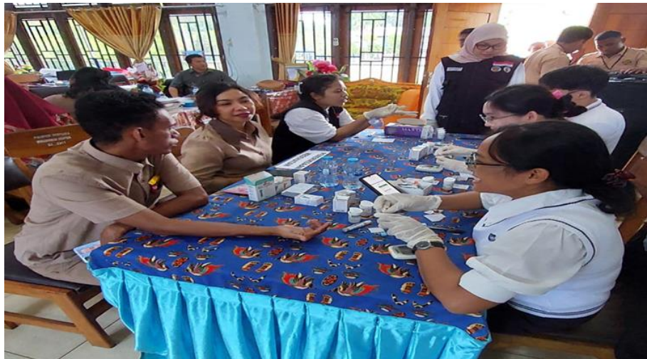
Figure 4. Cholesterol and blood pressure checks