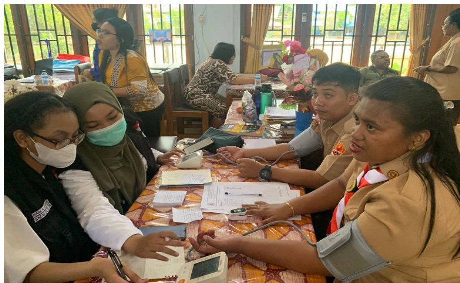
Figure 5. Cholesterol and blood pressure checks