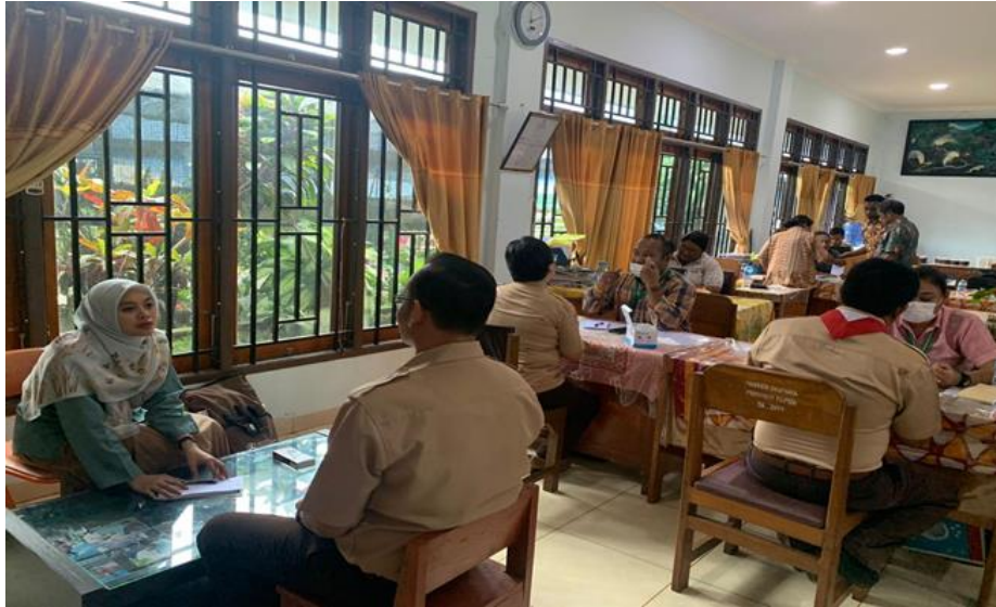
Figure 3. Consultation of health examination results by doctors