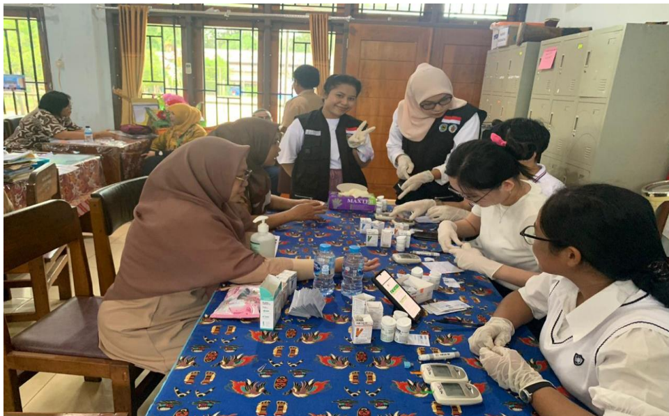
Figure 2. Blood tests by medical team