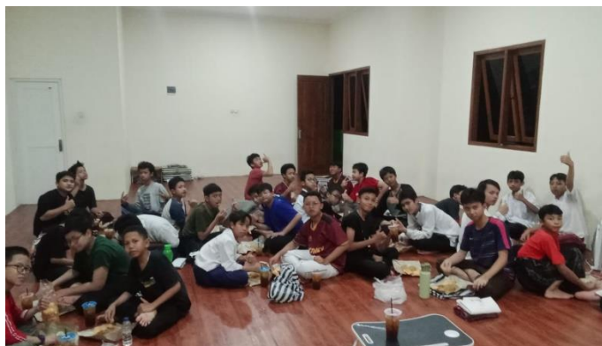
Gambar 2 Kegiatan Sosialisasi Kegiatan

Sukoharjo Village. As for the dock. This activity was carried out in turns at the representative house of Rw. 01 residents of Sukoharjo Village. The documentation of activities looks as follows.