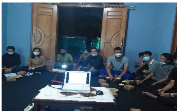
Gambar 3 Penjelasan Pelaksanaan Kegiatan

Before the implementation is carried out, the Community Service Team provides socialization and provides knowledge about activities GEMATI-POKDESI (Gerakan Jumat Berliterasi Pojok Desa Menginspirasi) . Activities are carried out in one of the residents' houses. Activities are carried out in a relaxed situation and condition, like an ordinary discussion. In essence, the community service team provides training to community representatives to be able to carry out these activities. The documentation of these activities is as follows.