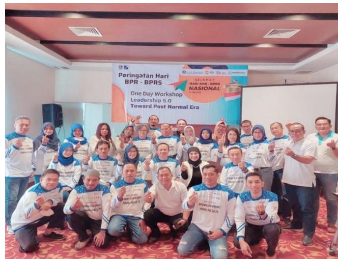
Picture 3. community service project was conducted by Smart Indonesia Academy

This community service project was conducted by Smart Indonesia Academy at the Atria Hotel & Conference on May 21, 2022, with the participation of BPR BPRS members from the Perbarindo Malang Raya Region. Community executives and directors participated in the event's opening, which was followed by material presentations, demonstrations, and assessments.