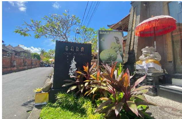
Figure 4. Silver Embers

Silver galleries are one of the MSMs owned by the home industry community and indirectly women have earned income generated from silver galleries. In the silver galleries facility, it is possible to state that women play an all in one role, where women act as craftsman, managers and concurrently as entrepreneurs. In running the silver business, women are additionally in promotion silver production from the exhibition held by the village, namely the Celuk Jewelry Festival. One of the Silver Galleries in Celuk Tourism Village, Bara Silver, is presented in Figure 4.