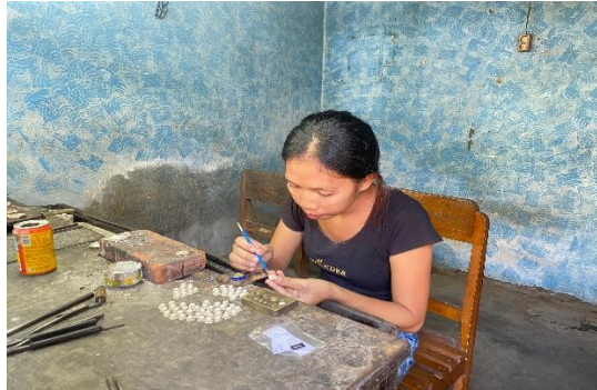
Figure 3. The Role of Women as Silversmiths

supported by research by Haftafilia et al., 2022 which asserts that women play a crucial role in preserving sustainability of local culture and is involved in various activities such as making crafts and other cultural activities. The role also serves as a link between the younger generation and promotes cultural diversity in the region. The role of women as silversmiths is presented in Figure 3.