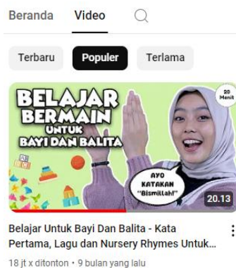
Figure 2. YouTube Animation Content Kinderflix Learning Videos for Babies and Toddlers

Kinderflix YouTube content videos have a positive response about the use of YouTube Kinderflix content. From YouTube Kinderflix Video Learning For Toddlers, We can see that the video has been watched 85,438,200 times, this number is not small. Another proof is that this content is widely used by parents or educators as a resource and learning medium. It can be seen in the image below with one of the animated video content with 18 million views.