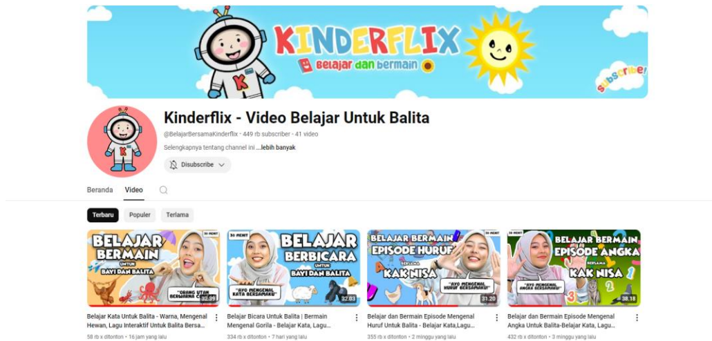
Figure 1. YouTube Animation Content Kinderflix Learning Videos for Toddlers

YouTube is a website where users can upload, watch, and share videos (Erlina et al., 2023). YouTube is one of the social media that is famous throughout the world, providing several interesting content. YouTube provides features for users to provide feedback, comments, likes, and so on. With the recommendation scheme in the YouTube application, this platform can recommend videos that suit the user's interests and preferences (Syahroni,