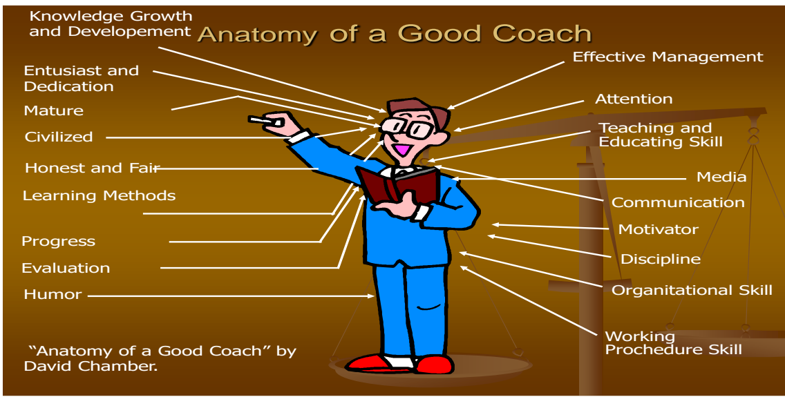
Picture 2. Anatomy of a good Coach