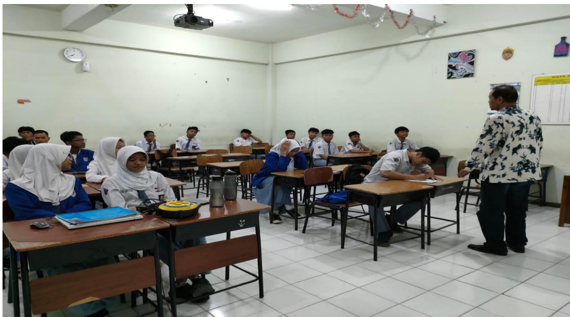
Figure 2. The Teaching and Learning Observation Interaction

In this chapter, the discussion depends on predicative presentation method could pertain Indication fluency speaking for SMK GIKI Surabaya aims for standardized with Affective Inquiry Taxonomy Domain with Descriptive Qualitative Analyze.