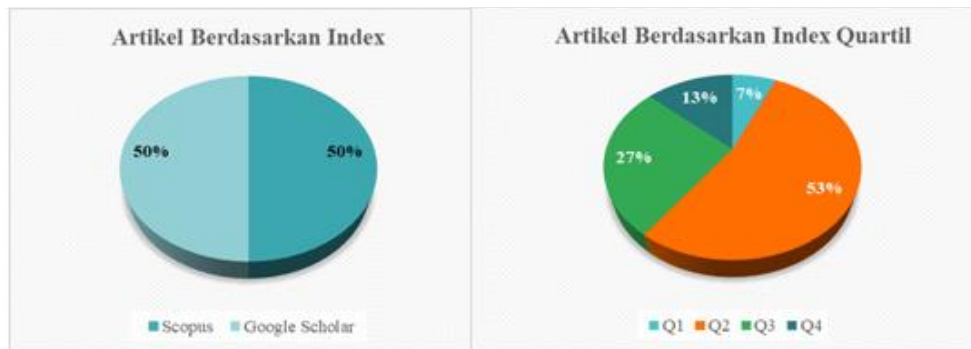
Figure 2. Article References Based on Publication

15 Scopus indexed articles, 7% are in Q1, 53% in Q2, 27% in Q3, and 13% in Q4. This can be seen in figure 2.