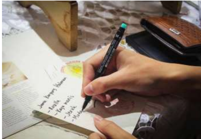
Figure 4. Collecting 'Long Life' Recipes

Often what's called traditional by now no longer corresponds to the so-called traditional in ancient times. And what is the cutting edge at the time labeled now often empty and only weight in packaging. This applies also in the medical world.