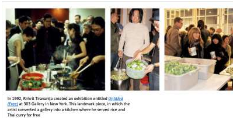
Figure 9. Rirkrit Tiravanija, Pad Thai (1990) at the Paula Allen Gallery in New York

pointing out elements such as the instability of the work, the potential for a mere display of pleasure and entertainment. She reevaluates the meanings of 'participation' and 'collaboration' in comparison to 'interactive' and 'responsive,' ultimately questioning how participatory performance art has also become co-opted by the market.