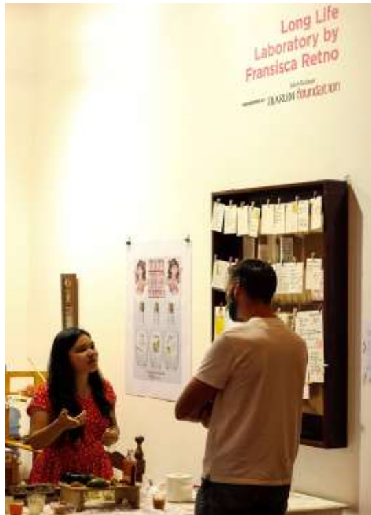
Figure 7. Sharing Experiences with One of the Participant

During four days of performative activities from 25 th August until 28 th August at Pasific Place Ballroom Mall Jakarta, more than 80 longevity recipes had been collected from visitors of Jakarta Bazaar Art 2016 which generally originated by urban community background. The responses of its art