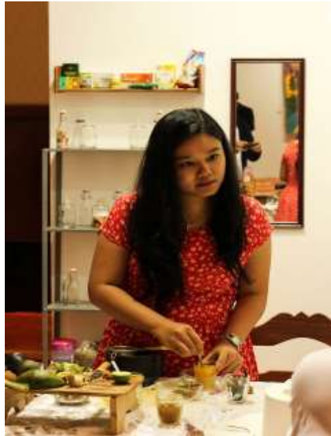
Figure 6. Performer was Serving the Drink While Empathizing

share their long life prescriptions in order to help each other. Which are interesting that the prescriptions the told are often a psychological suggestions such us quotes of always thinking positive.