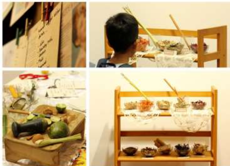
Figure 3. Art Installation

desire, and then the ideas manifesting in the form of health products as well as traditional to modern form of beauty, in this work the attention thus go to the audience itself