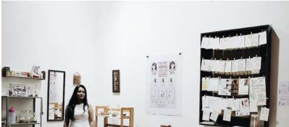
Figure 1. Artist After the Performance "Long Life Laboratory"

them to make their own style longevity recipe, which depended on perception, memory, information, and expectations of themselves on living a long life.