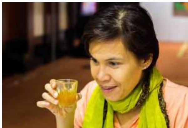
Figure 8. The Participant was Tasting Their Own Recipes

In the historical context of participatory art, performance art has become a more politically operative or socially bound medium compared to painting, sculpture, or literature. Claire Bishop, a British art historian and critic, has contributed