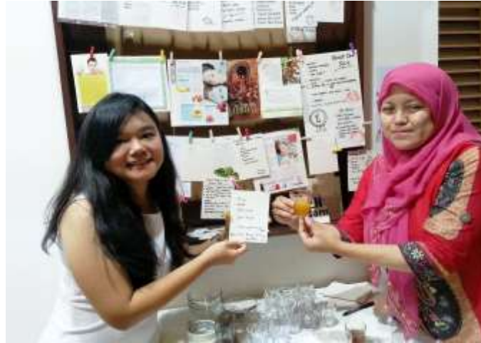
Figure 2. Interaction with the Participant

The development of the theme of this also automatically coupled with the development of the concept and context. When the previous works presents a situation of confusion because of how marketing sells ideas about living a long life that is the instinctive human