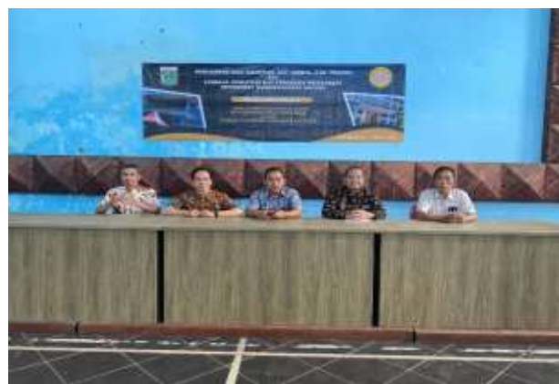
Figure 4. Discussion with Members of the Village Consultative Band

A prime example of community participation in the execution of the village consultative framework's duties in Sukopuro village, Jagung district, Malang regency, including debating and reaching a consensus on the draft village law together with the village head; facilitating and directing the community's desires; and monitoring the village head's performance.