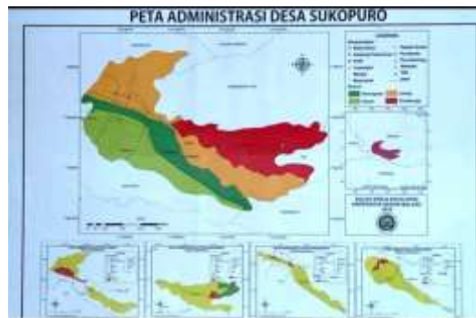
Figure 1. Map of Sukopuro Village, Jabung District, Malang Regency (Data Processed by the Author)

Village spans 651 hectares. The four hamlets of Sukopuro Village are Pandanrejo, Kepuh, Karangrejo, and Loring. Sukopuro Village offers good potential for tourism, agriculture, and plantations in the region around it.