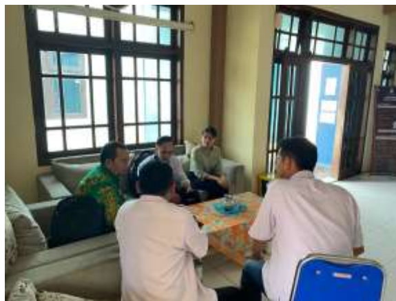
Figure 3. Primary Data Collection at the Sukopuro Village Office

partner and is the Village Consultative Body (BPD).