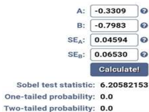
Figure 2. Indirect Effect of LDR on SR